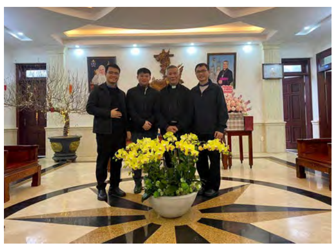
Salvatorians with the bishop of Vihn