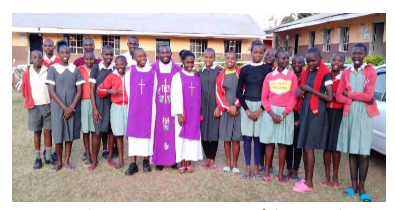
Spiritual accompaniment is a part of the curriculum