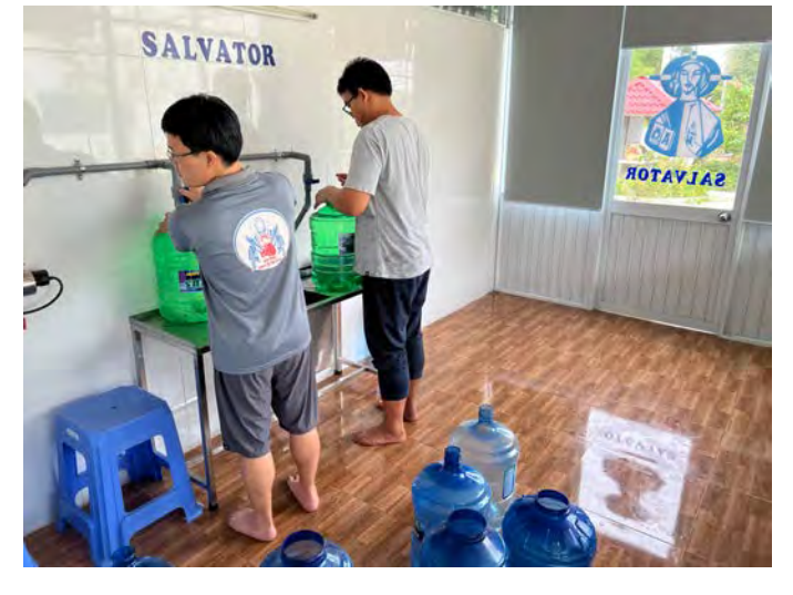
Salvator drinking water project