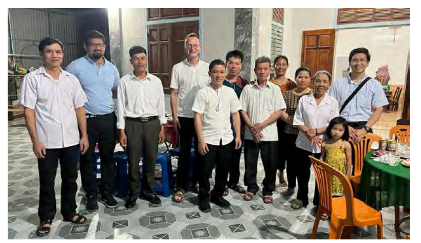
Visiting the family of one of a Salvatorian members