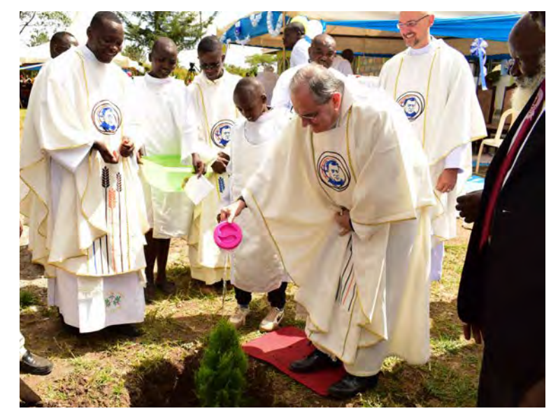
The Superior General planting a tree in memory of the event during the blessing of the new formation house in Eldoret-Kenya.