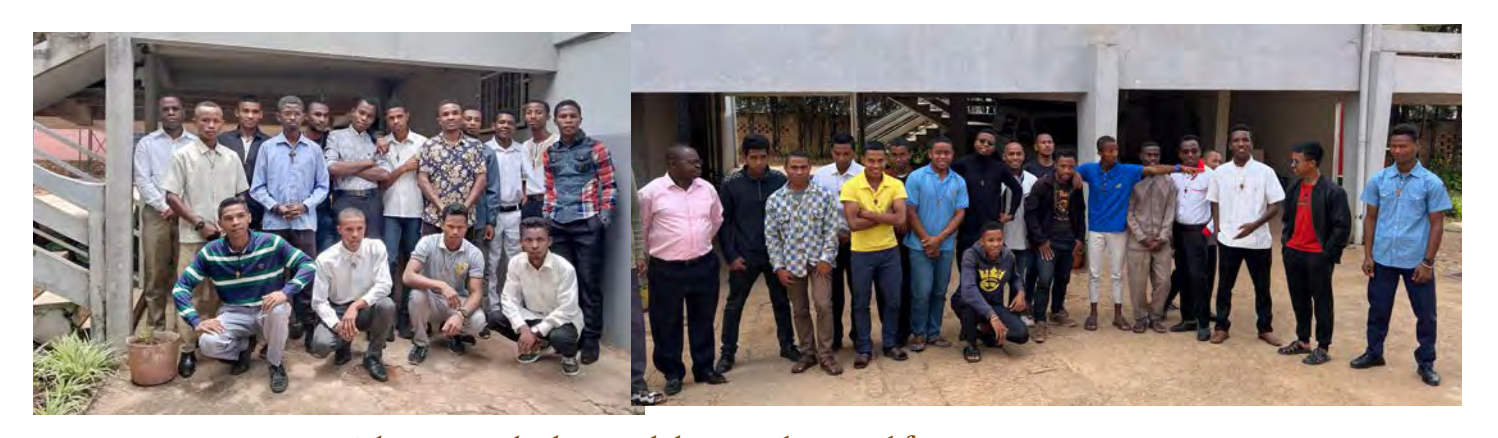
The mission had 31 candidates in the initial formation in 2022