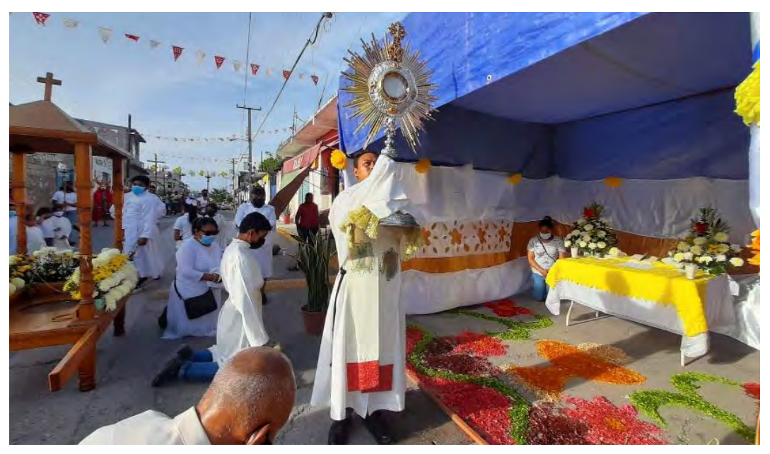
Feast of Corpus Christi