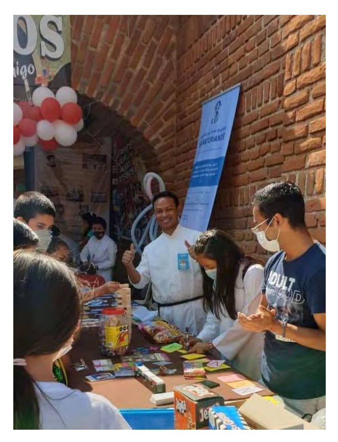
Salvatorian desk at a vocation promotion event