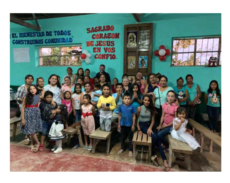
Spiritual accompaniment in the school of Huaduillo.