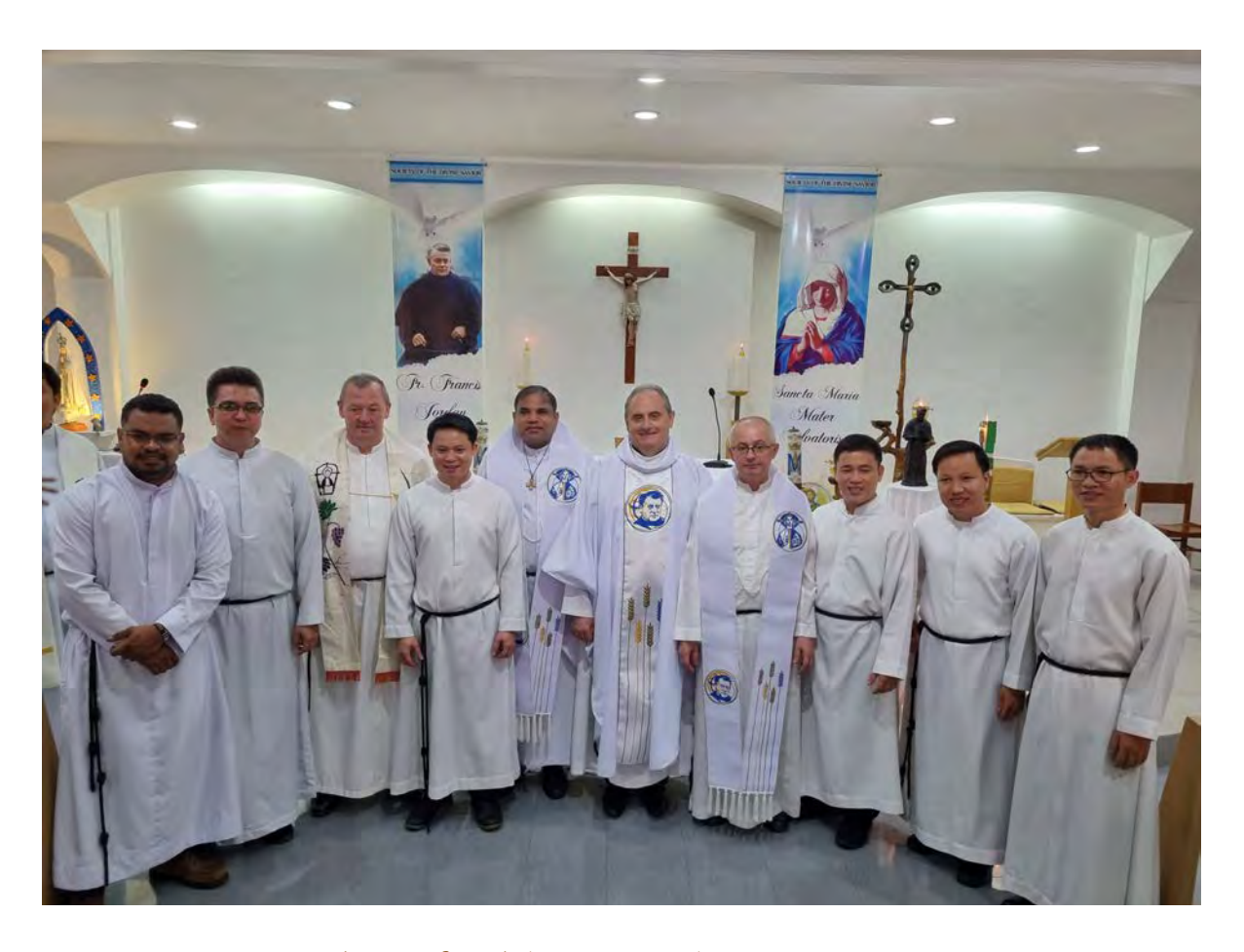
Six members professed their perpetual vows on 16 June 2022