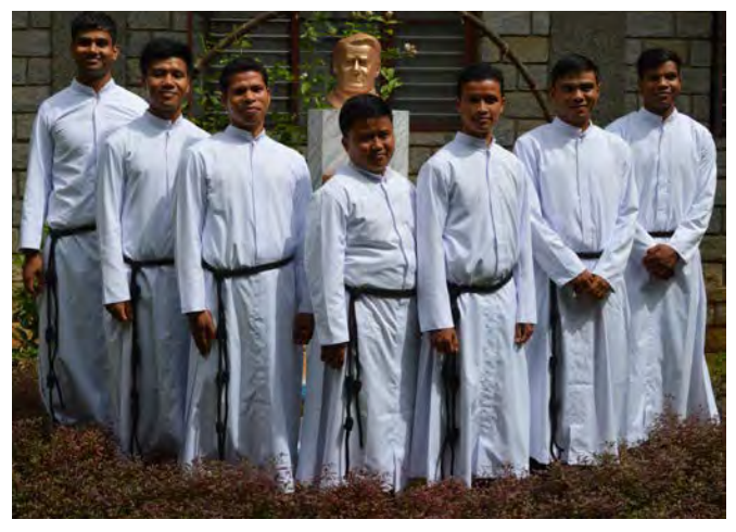
7 young men professed their first vows in the Society through the Indian Mission Vicariate: