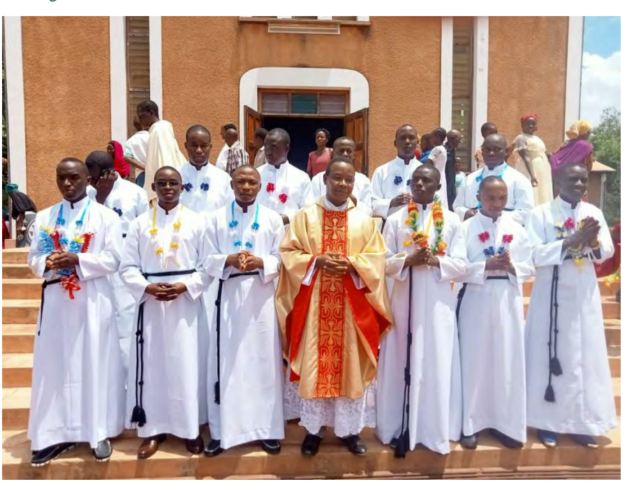
10 novices, professed their first vows in the Society through the Tanzania Mission Pro-Province: