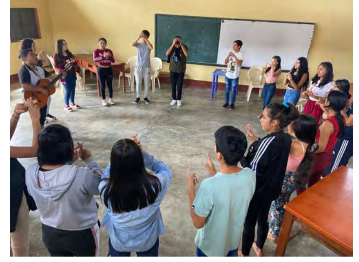
Youth meeting - Huarandoza and Huarango - parish headquarters.