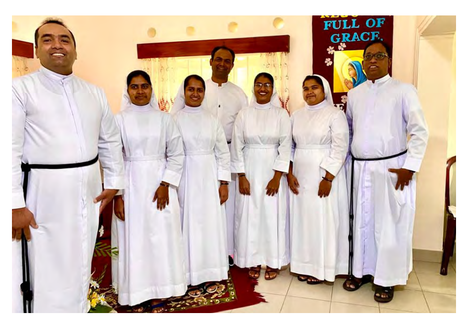
Salvatorian Fathers with the Sisters of the Divine Saviour, Sri Lanka