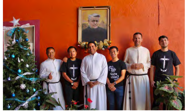
Formation community during the new year celebration