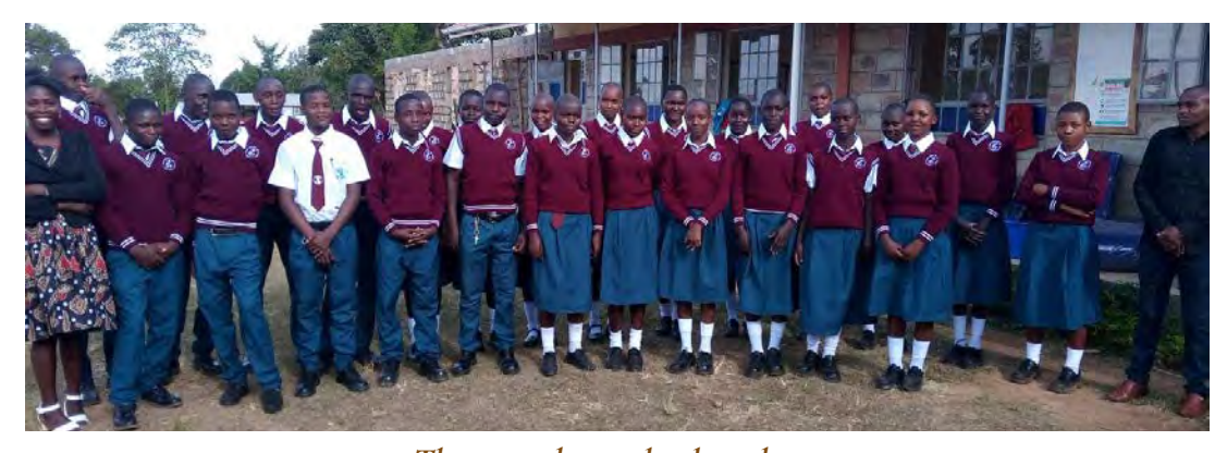
The secondary school students