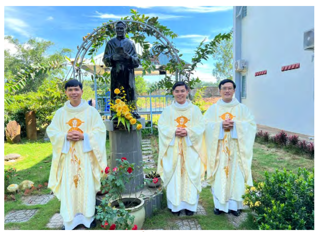
The newly ordanied priests of the Vietnamise mission , 2022 \,