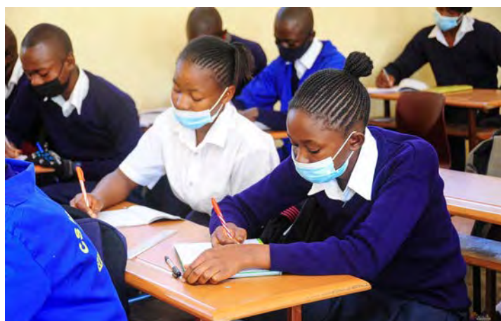
Wokovu had total enroment of 2405 students in 2022