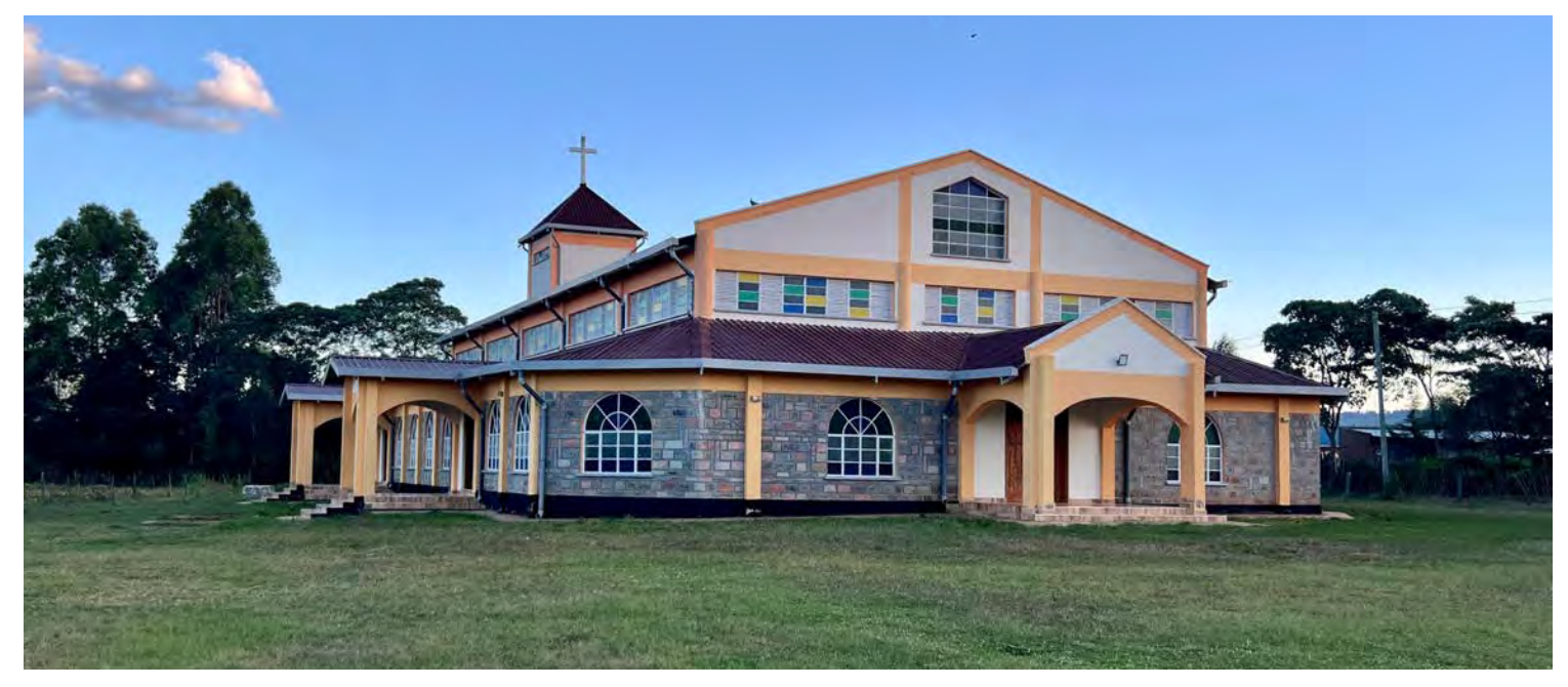
Newly constructed St. Mary, Queen of Peace church where Salvatorians minister since 2015.