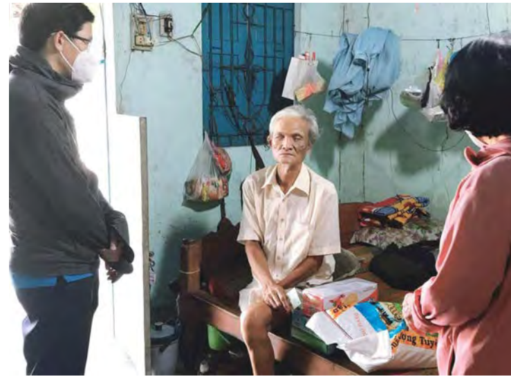
Salvatorians visiting sick and old