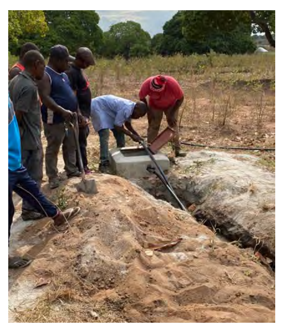
A new water well for the school