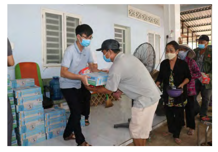
Food is distributed to the poor and needy by the Salvatorian community in Ben Cat in collaboratin with lay people