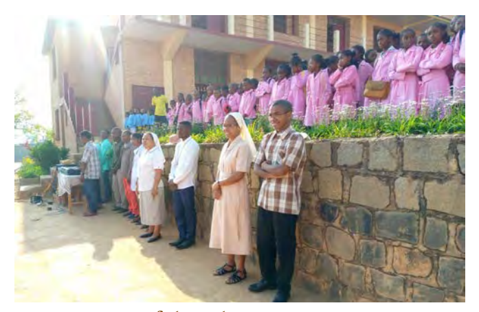
Promotion of vocations to the Society is an important activity of the Salvatorian mission in Madagascar. They visit parishes and schools to speak about the Society to young boys and girls.