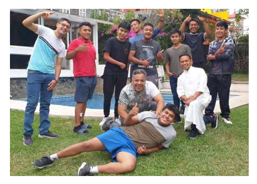
Vocation promotion program