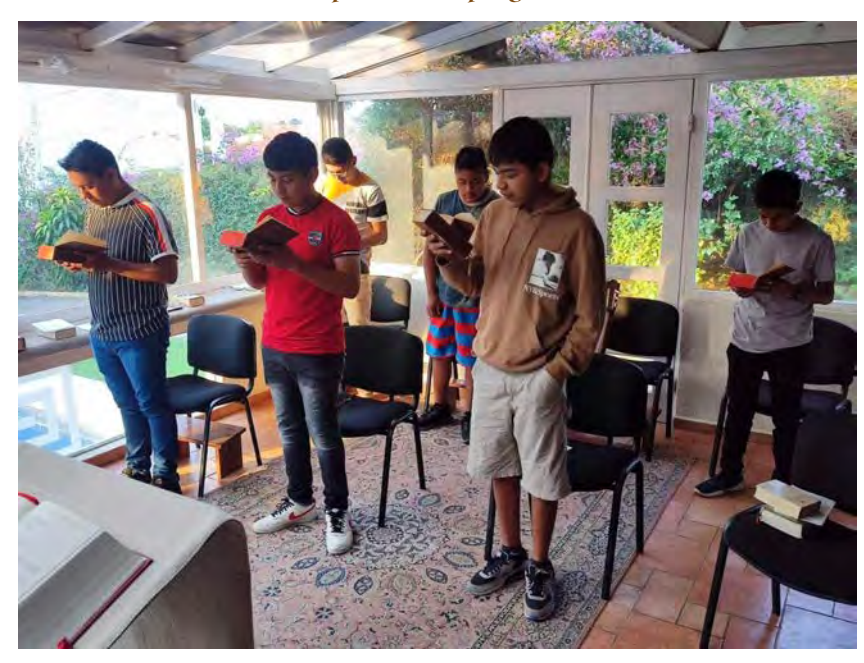
Vocation encounter in the formation house, Cuernavaca