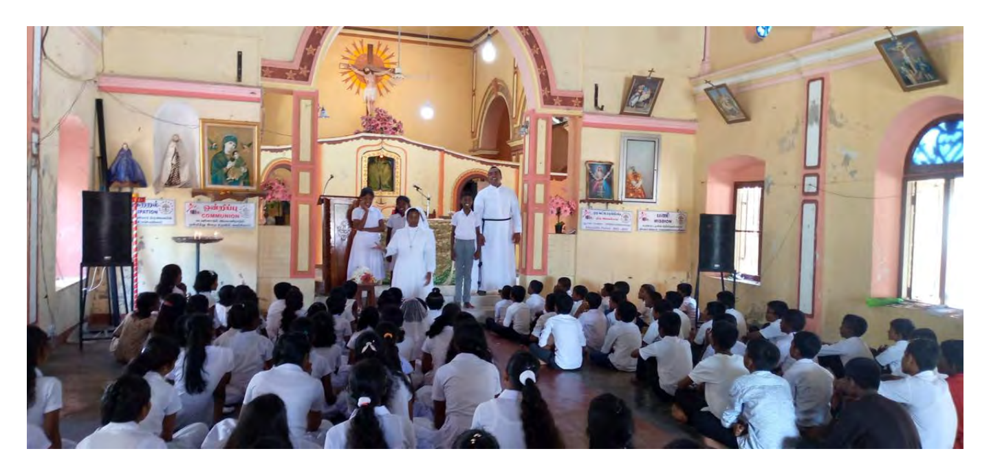
Salvatorian Fathers and Sisters come together to promote vocations to the Society.