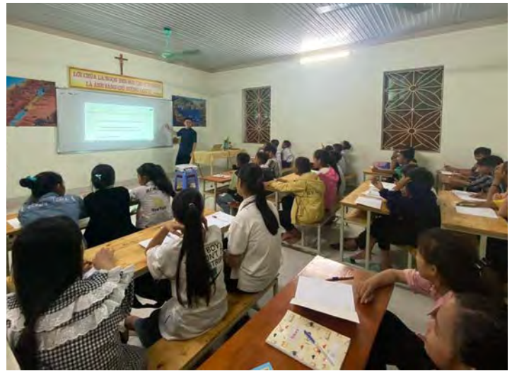
Salvatorians accompanying young people in Vietnam through various youth programs