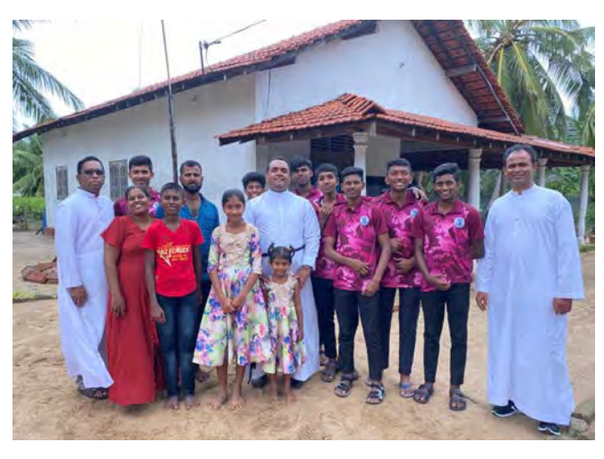
Salvatorian Fathers visiting candidates' home