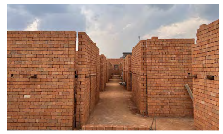
The corridor to the dormitories