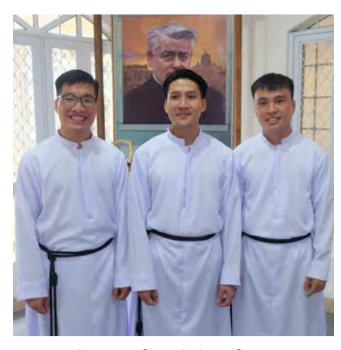
3 members professed their first vows through Vietnamese Mission