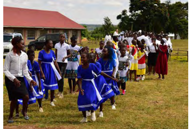
Solemn Holy Eucharistic celebration at St. Marys' Queen of Peace parish