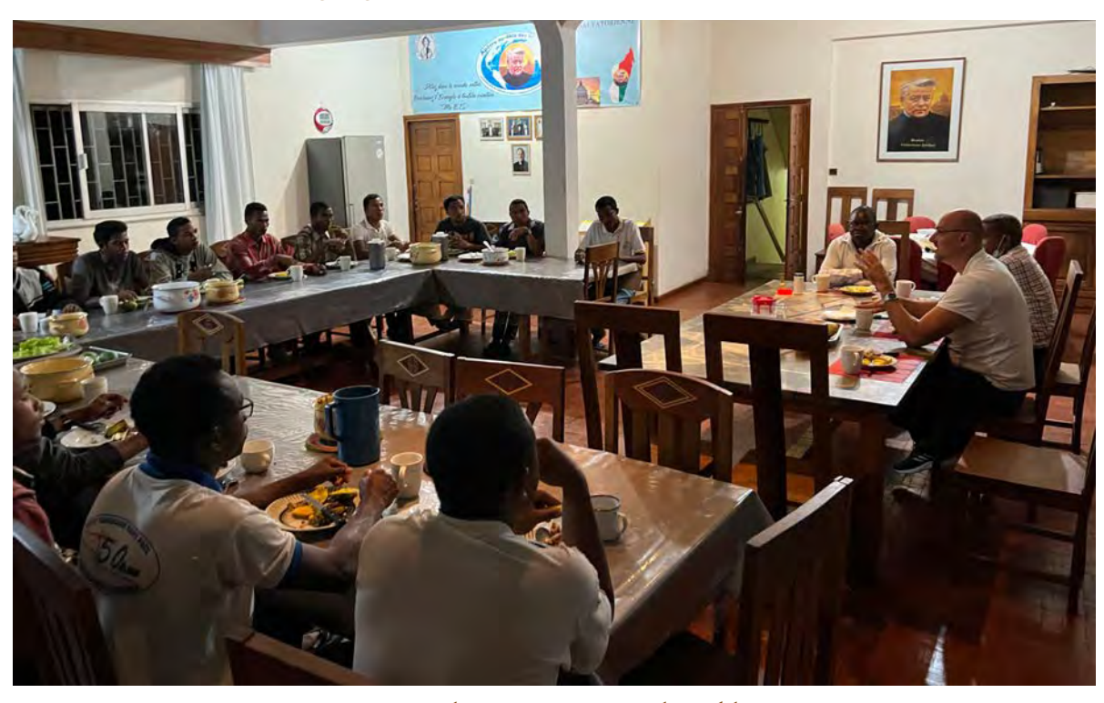
The community at the table