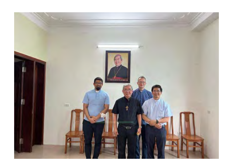
Visiting the bishop of Hà Tĩnh