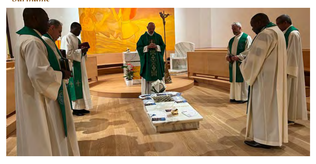
Everyday prayer at the Founder's tomb for the missions