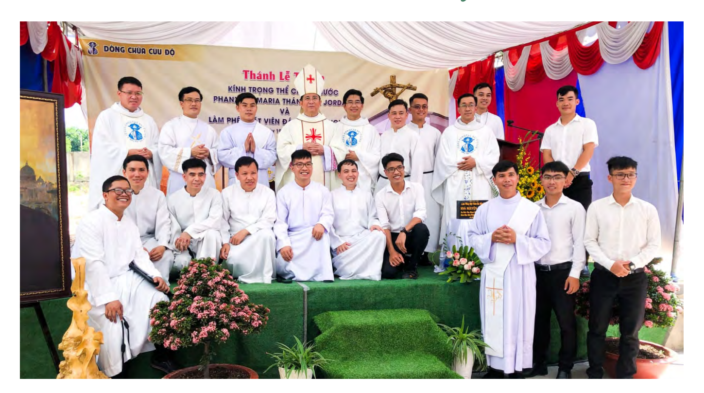
The bishop with the salvatorians