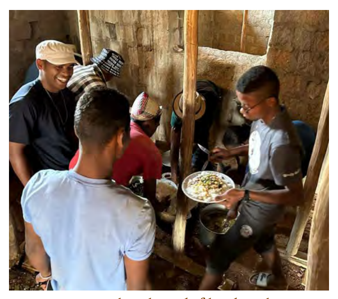
Meal at the end of hard work