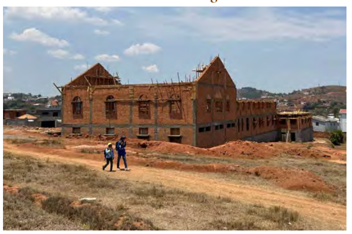
Side view of the house under construction