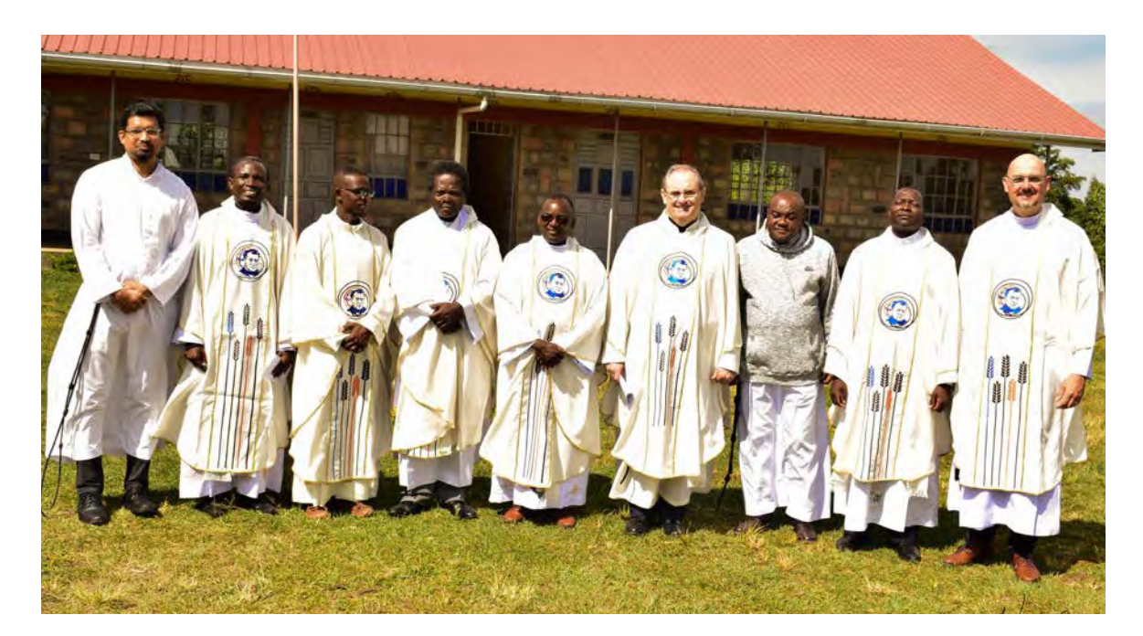
The Salvatorian members during the inauguration of Bl. Jordan Formation House, Eldoret-Kenya