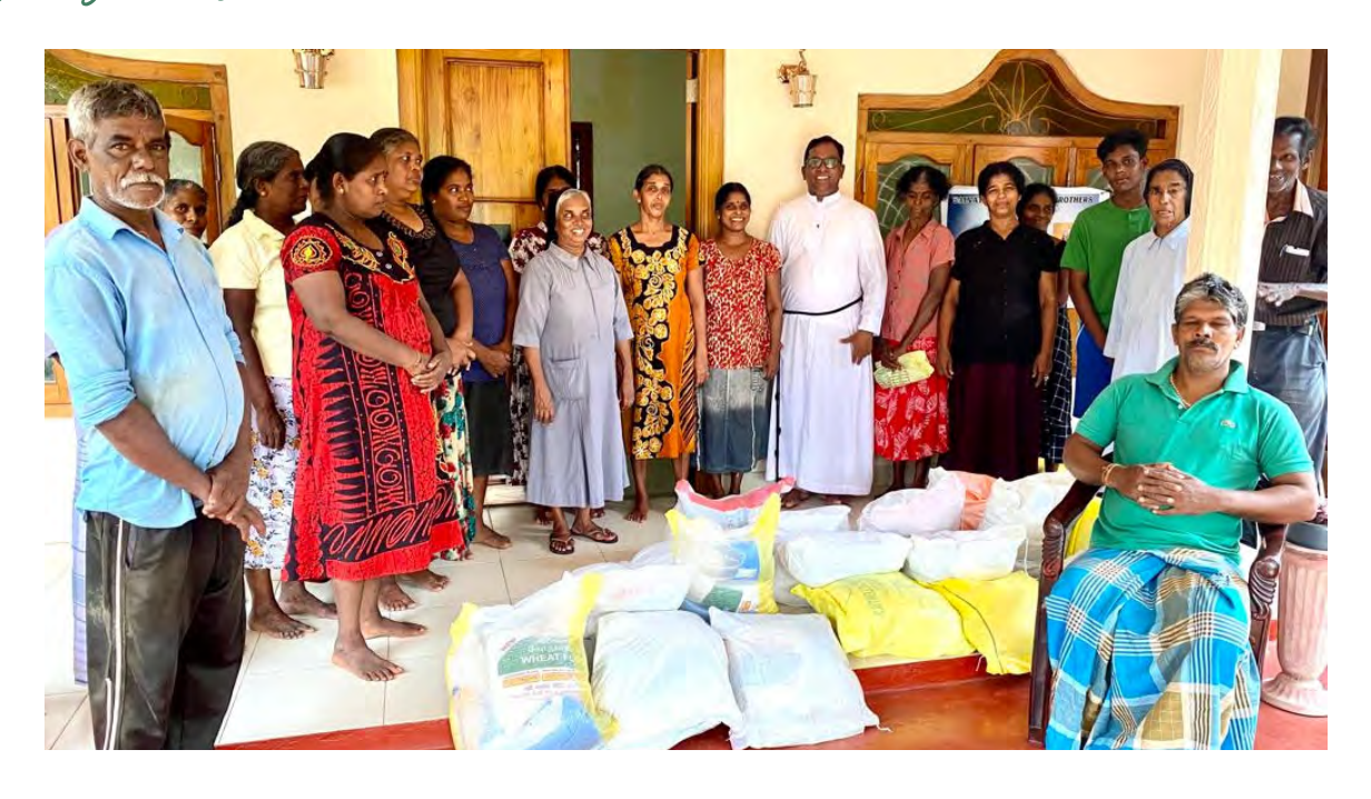
Sri Lanka went through a very bad political and economic crisis in 2022 resulting in huge shortage in the availability of food, medicine, fuel and other basic supplies. The Salvatorians in Sri Lanka offered food and medicine support to the most needy during the crisis.