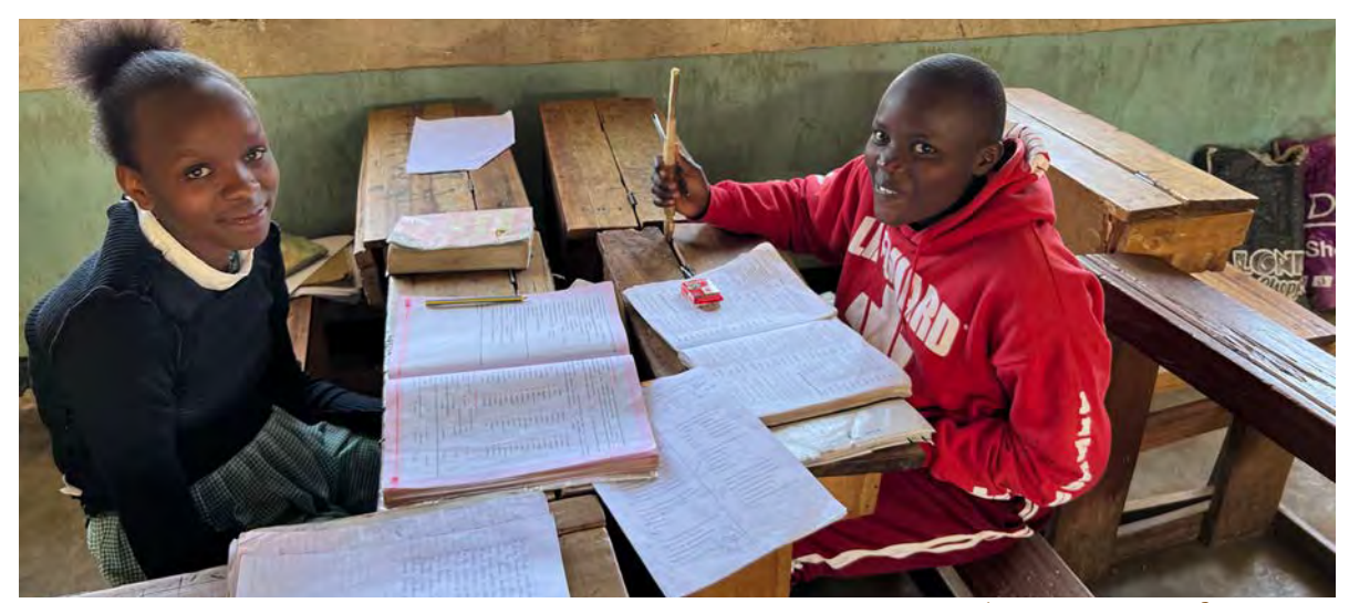
Students preparing for exams

Mater Salvatoris Academy is a Salvatorian primary and secondary school complex located in Eldoret-Kenya. It has 440 students in total.