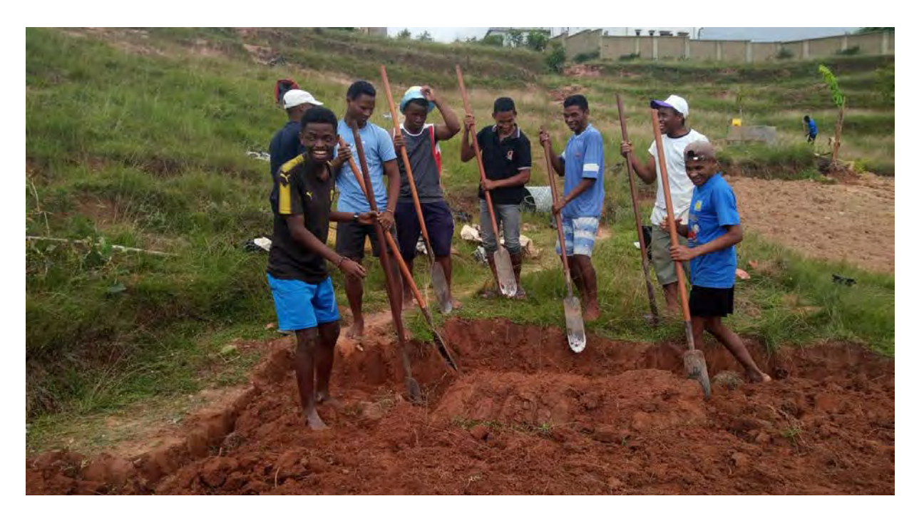
The candidates in the field