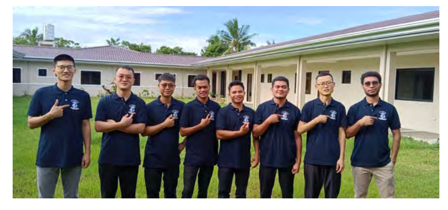
8 new Salvatorian novices in 2022