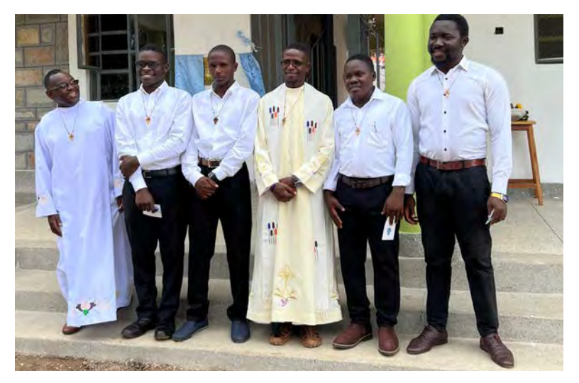
Four new candidates (two from Kenya and two from Uganda) for the Kenyan mission with their formator and mission superior.