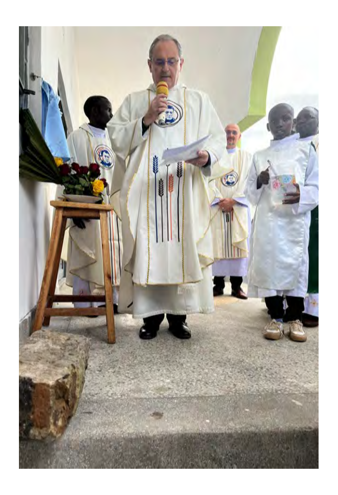
The Superior General blessing the foundation stone for a new school building in the Salvatorian mission, Eldoret-Kenya