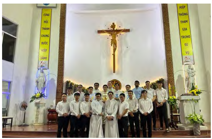
The Salvatorian community of Vietnam