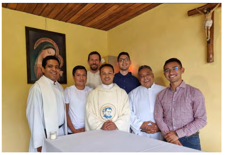
Celebration of the feast of Mater Salvatoris