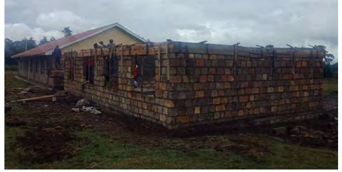
A new classroom is being built to accomodate growing number of students