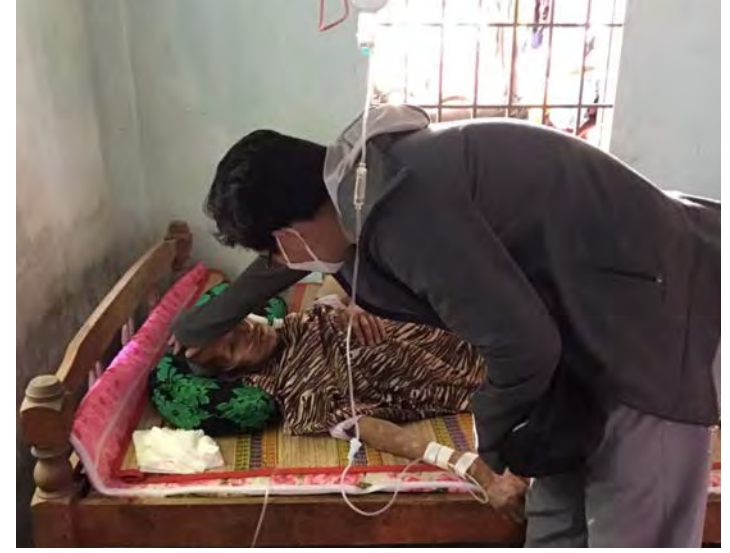
Visiting the sick