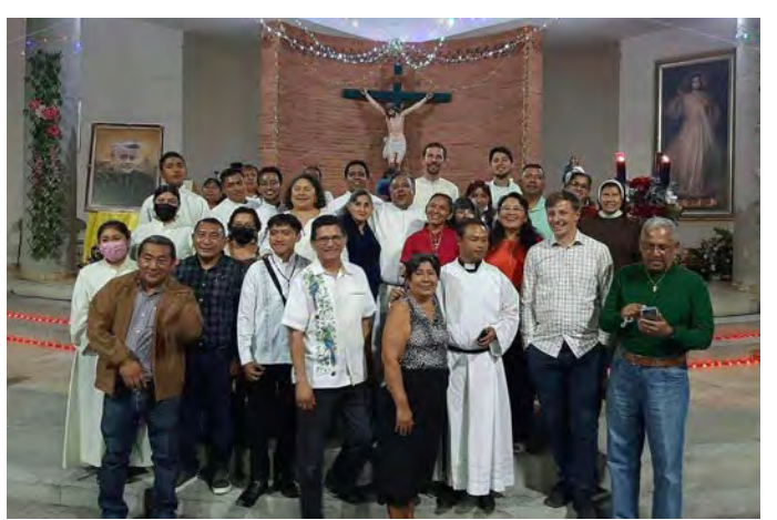
Celebration of Society's foundation day