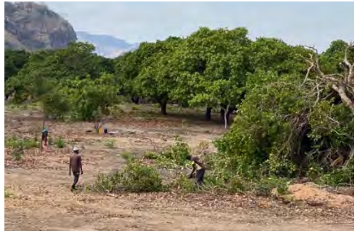
Cleaning the ground to prepare for the foundation