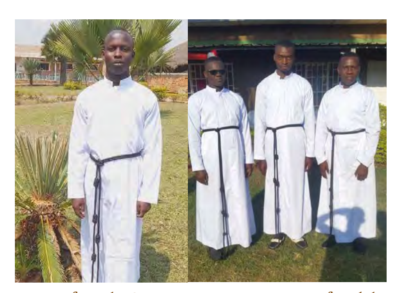
4 novices from the Congo Mission Pro-province professed their first vows in the Society on 8 September 2022