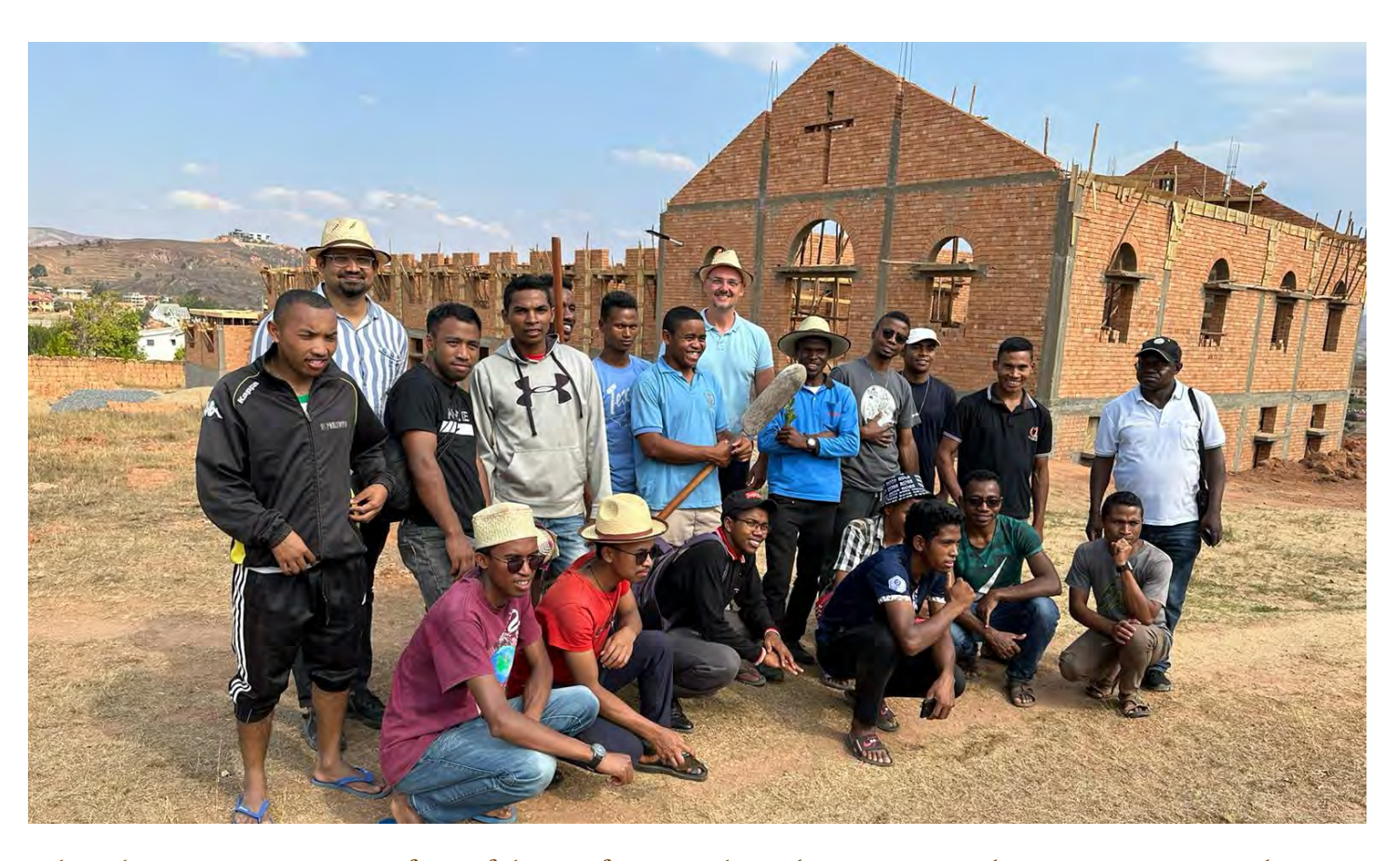
The Salvatorian community in front of the new formation house being constructed at Antananarivo, Madagascar