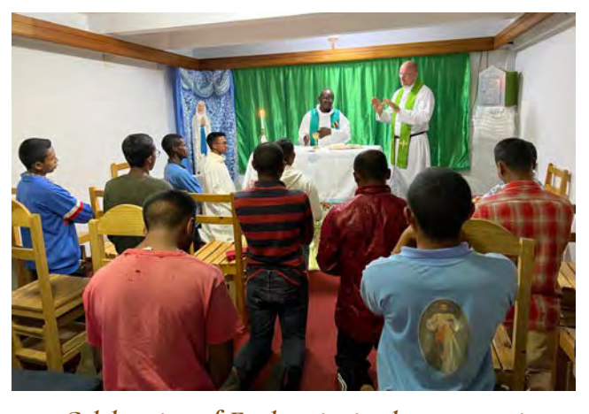
Celebration of Eurhcarist in the community