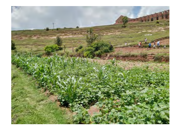
The vegetable garden