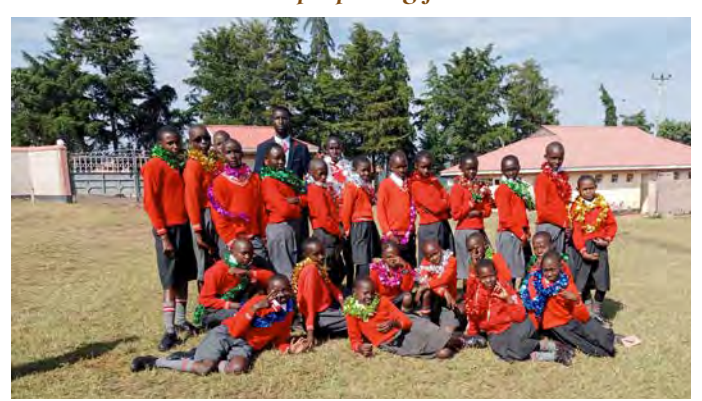
A passing out batch