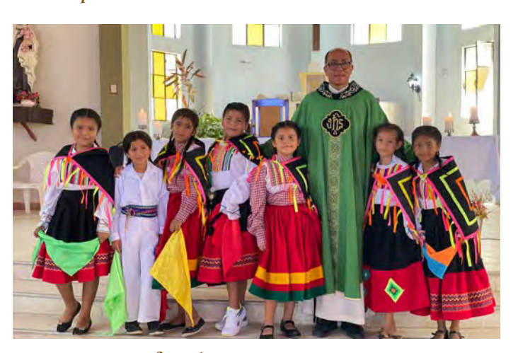
Preparation for the Sacraments