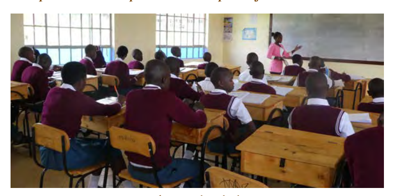
A secondary school classroom