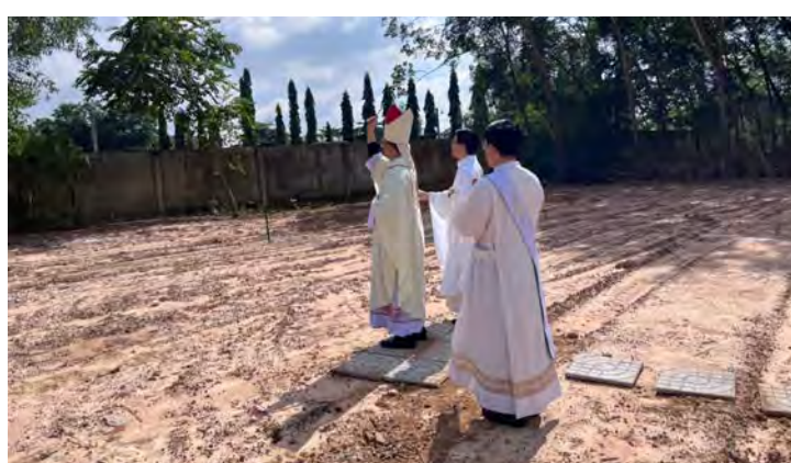
Laying the foundation for new Salvatorian chapel in Ben Cat