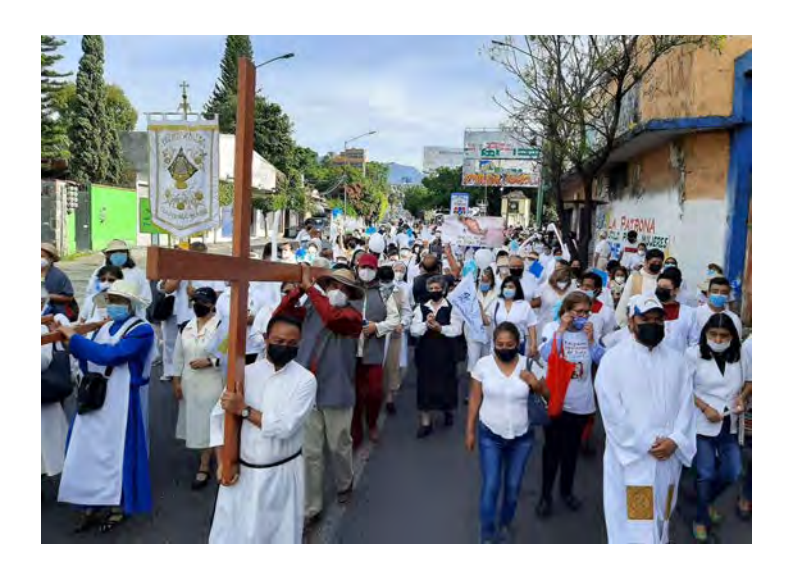
The march for peace called by Bishop Ramon Castro