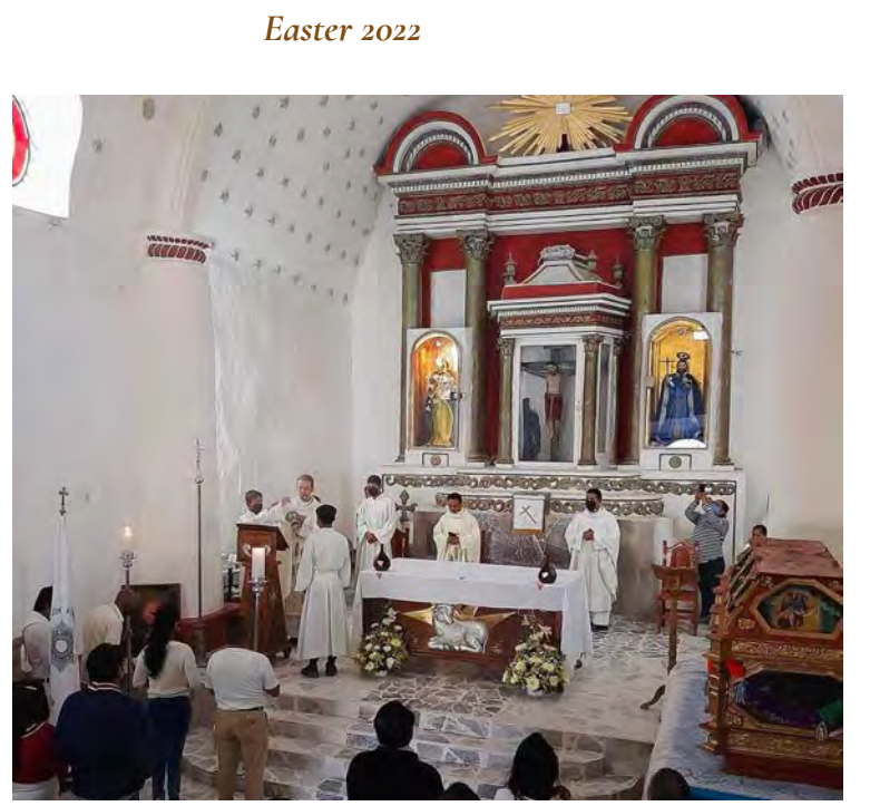
Reopening ceremony of the parish church after the earthquake of 2017