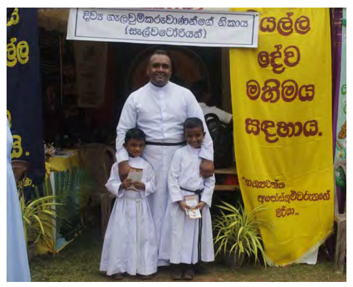
Salvatorian desk at a vocation promotion event