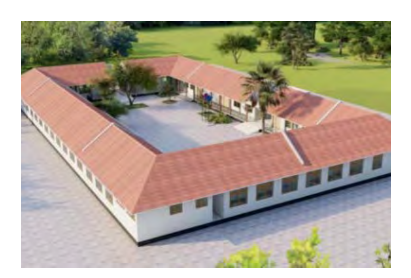
Prosposed school building

The preparation for the construction for the Bl. Jordan secondary school began already in 2021 which resulted in finalising the drawing of the proposed school and the foundation stone for the school building was laid in the last quarter of 2022. This is first Salvatorian secondary school in the Tanzanian. The school will be a blessing to the children in Masasi- Tanzania. The construction is ongoing.