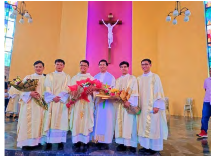
Newly ordained priest and deacons in 2022