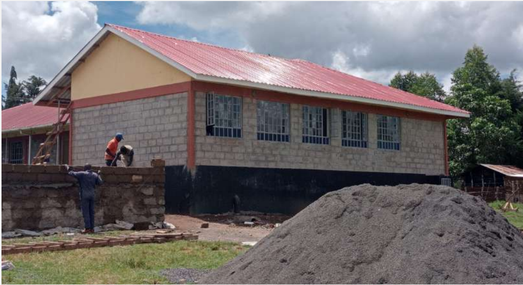
Newly built laboratory building

The secondary school completed construction and equipment of a new laboratory building through the help of donors in 2023. The laboratory will further improve the quality of education