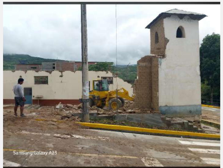
Refurbishment and construction of chapels damaged by recurrent earthquakes