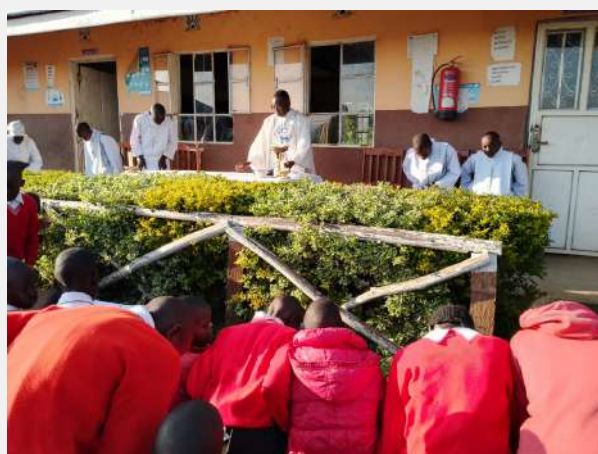
Holy Eucharist offered at the school