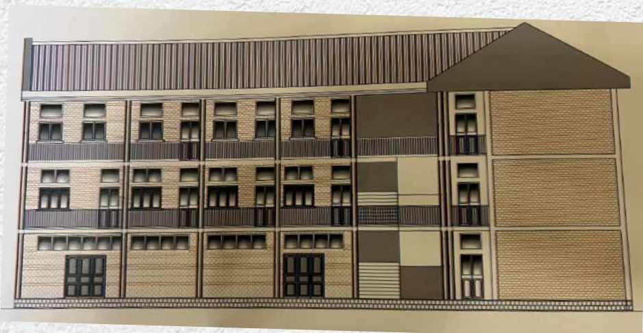
The proposed Secondary school building plan. A portion of the grant arrived in 2023 and we are waiting to begin the construction in 2024