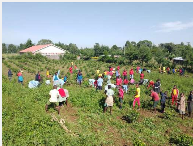
The children at the school vegetable garden