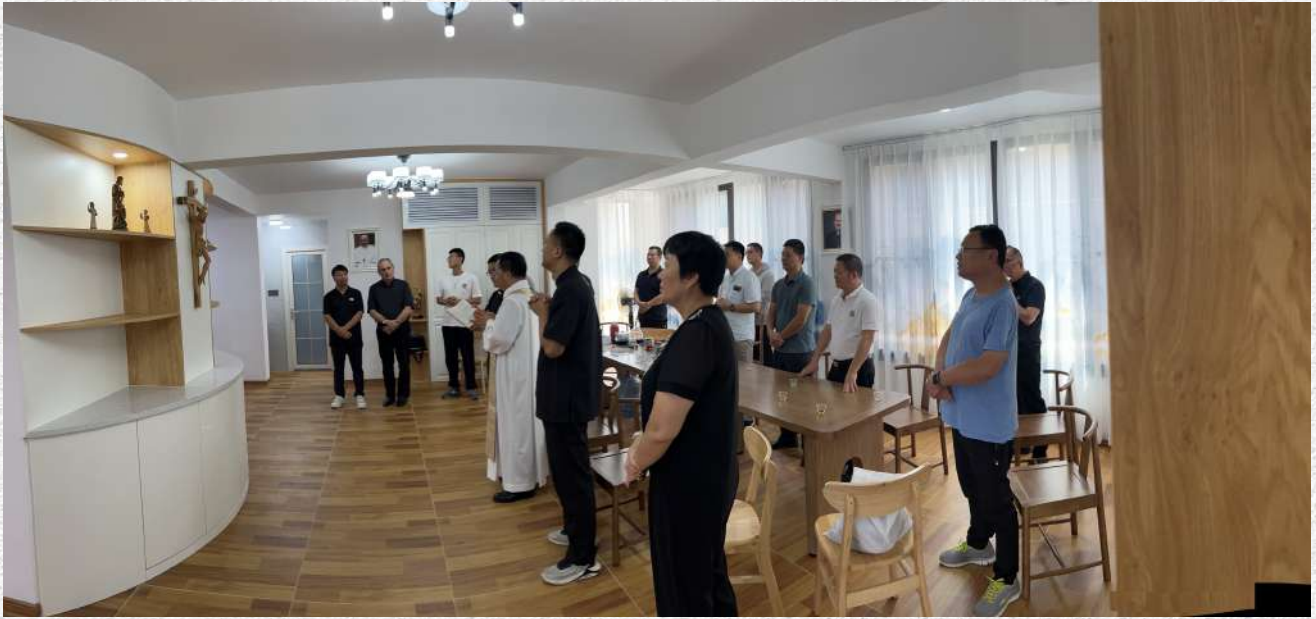
The Superior General together with the local Bishop blessed the Salvatorian House in China on 21 July 2023,