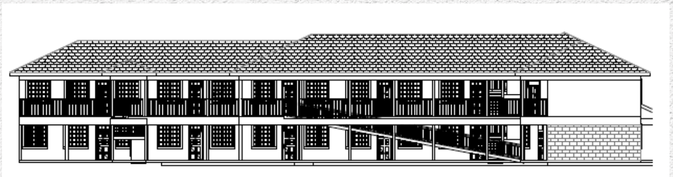
The proposed Secondary school building plan. The project was approved in late 2023 and the construction will begin in 2024