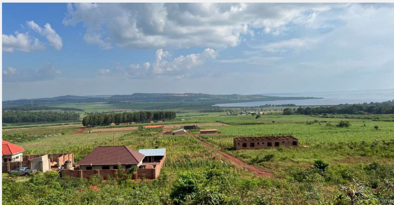
The Society purchased 10 acres of land in Jinja in 2023 overlooking lake Victoria for the proposed international African Noviciate House