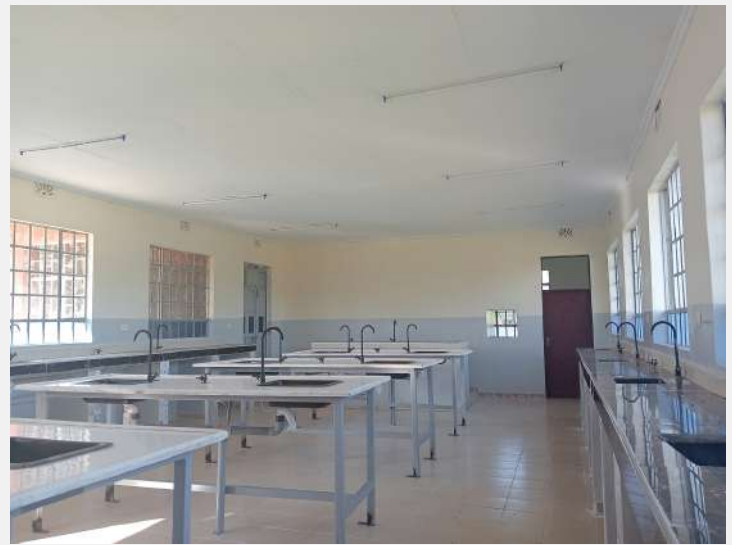
Inside the laboratory room