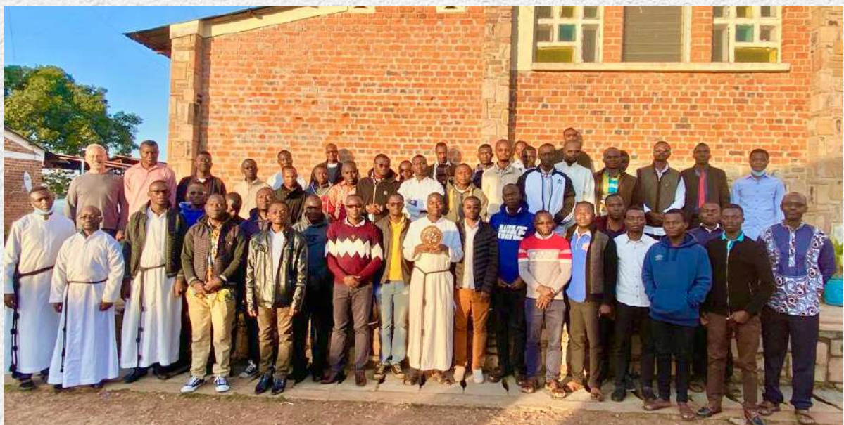
The Salvatorian Community in Congo with the visitors from the Generalate