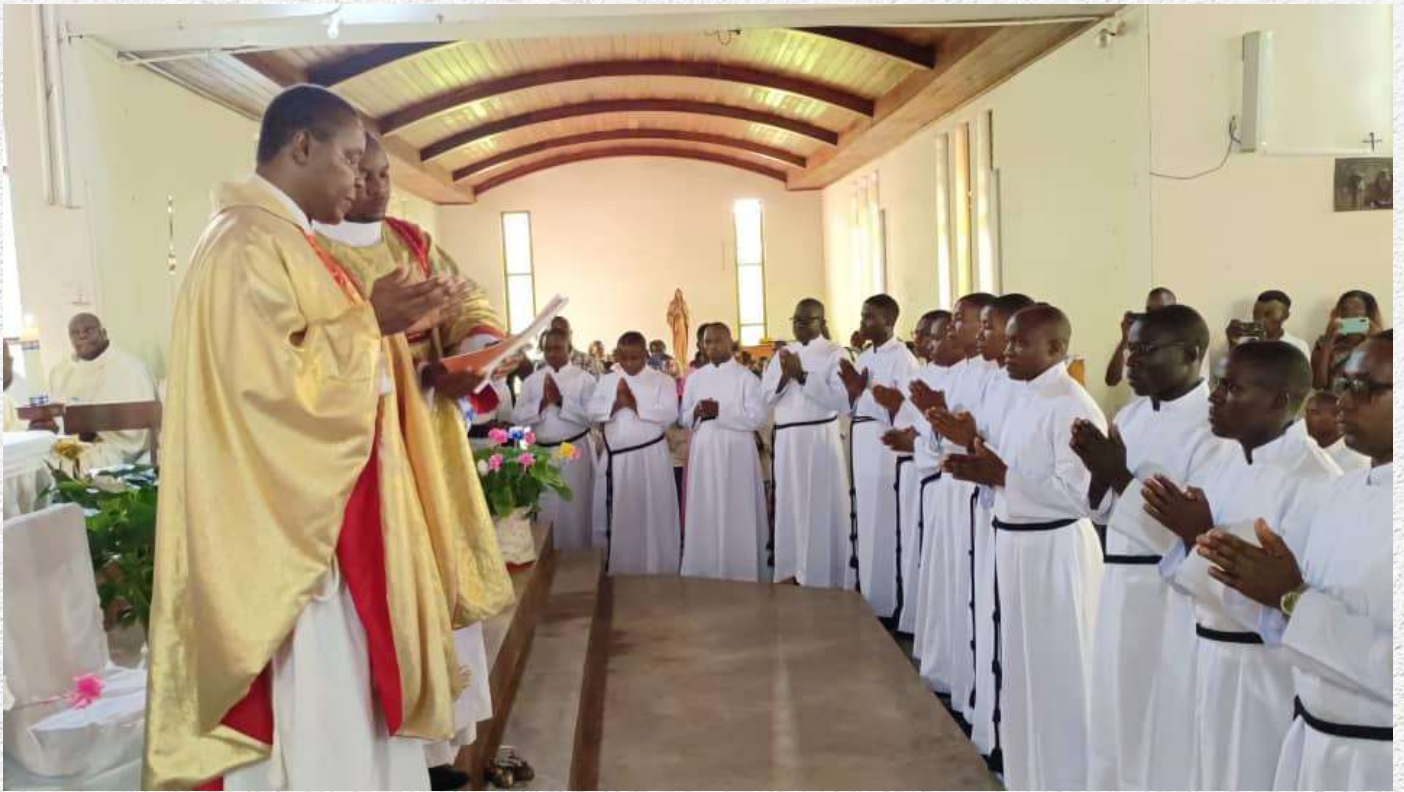
First profession on the 08 December 2023 at St.Joseph Formation Community, Namiungo. There were 22 newly professed confreres.