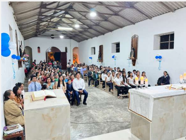
Patronal Feast of the Immaculate Conception - Patroness of the parish