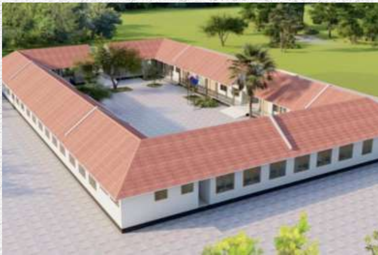
The proposed Secondary school plan