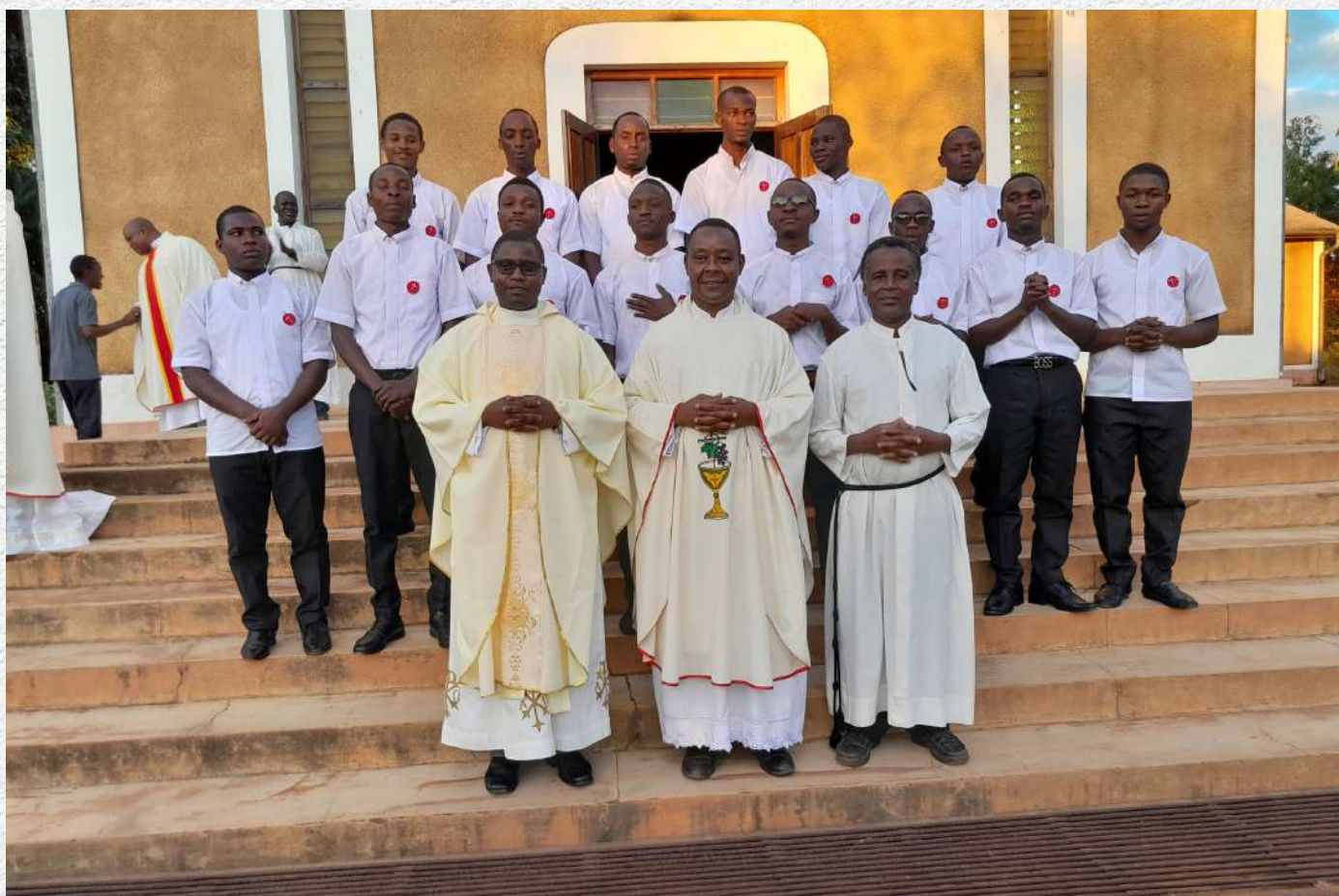
14 young men who were received into postulancy on the 24 June 2023 at St. Joseph Formation Community, Namiungo