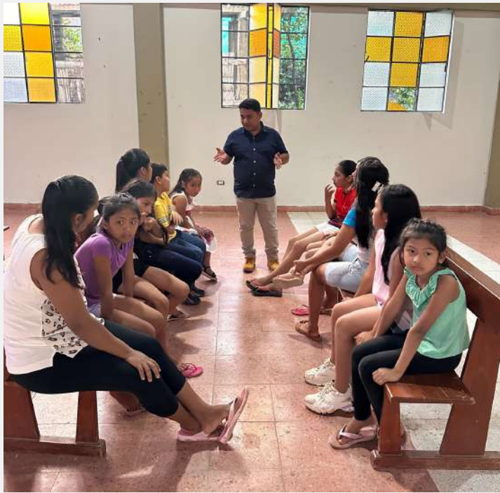
Training of altar servers