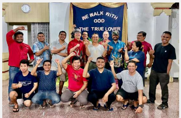
The SVD community in Yogyakarta who had been hosting the three Salvatorian confreres for a year