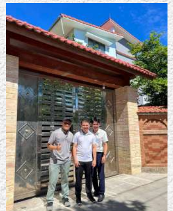
The Salvatorian community house in Vinh established in 2023