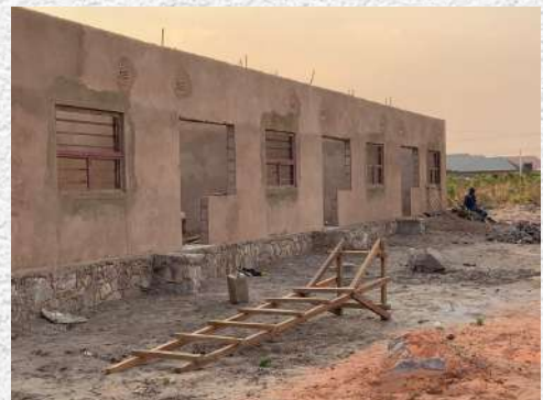
The construction is underway