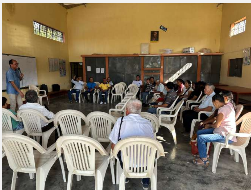
Parish Assembly 2023 with the leaders of the communities. The Assembly coordinates the year's activities for the parish.