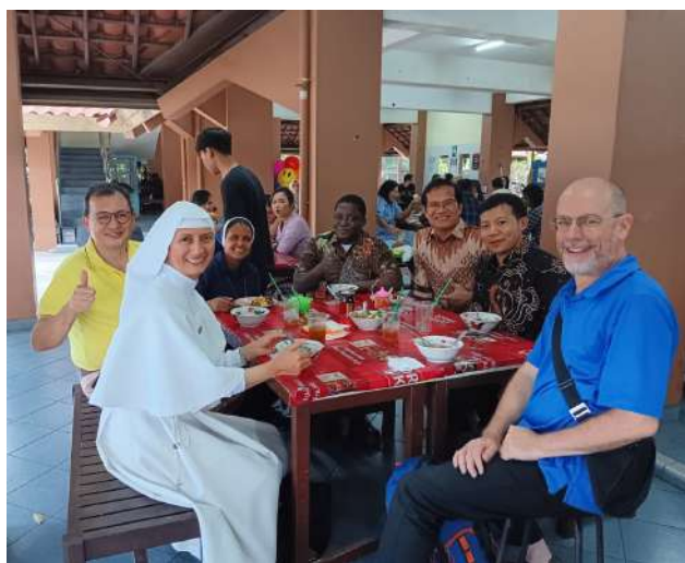
SSPS sisters and Fathers at the University eating Bukso and iced tea in the Cantine.