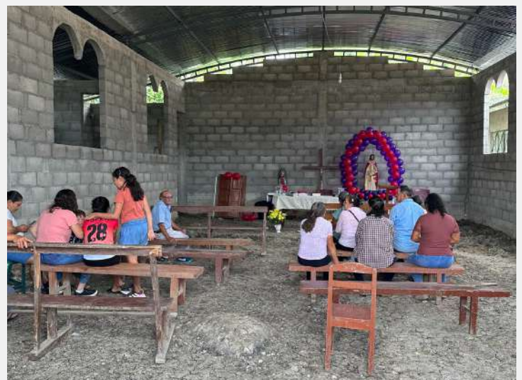
Attention to the various communities of the parish with celebrations of sacraments.