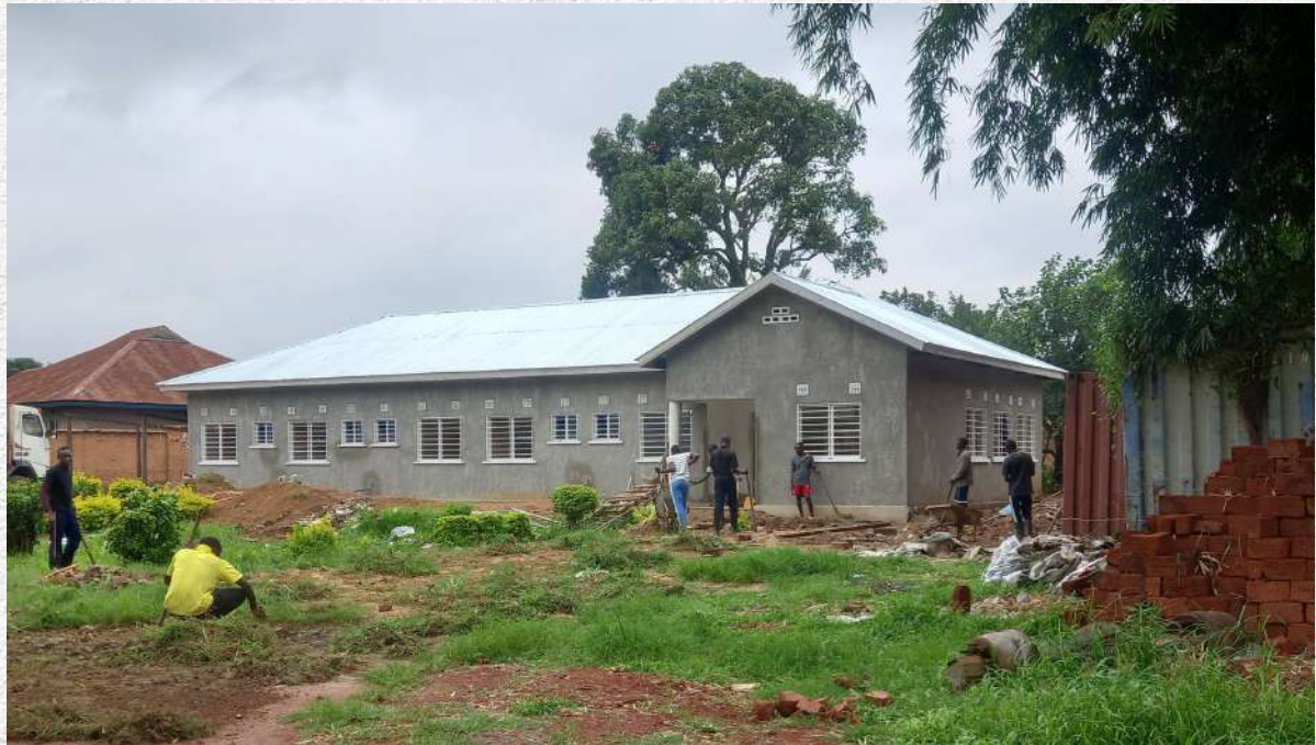
A new formation house of candidates is under construction in Lubumbashi.