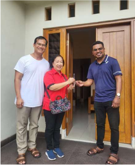
Handing over of the Key of the rented house

After living for about one year with the SVD community in Yogyakarta, the three Salvatorians moved to a rented house to establish a temporary Salvatorian community which will also accomodate vocations from Indonesia