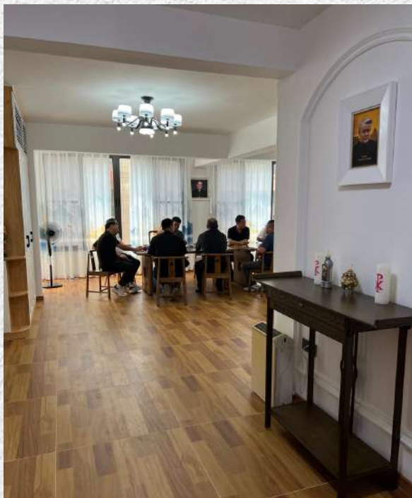
A View of the corridor of the newly blessed Salvatorian Community house