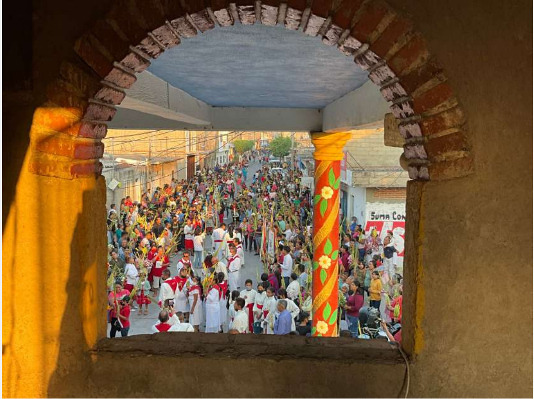
The parish community gathered for palm Sunday celebrations