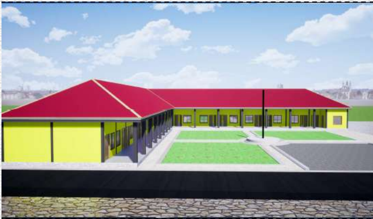
The proposed Secondary school plan