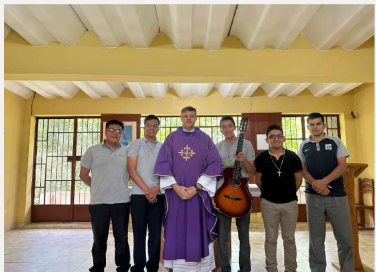
Meeting and accompaniment of the youth ministry of the parish and the apostolic vicariate.