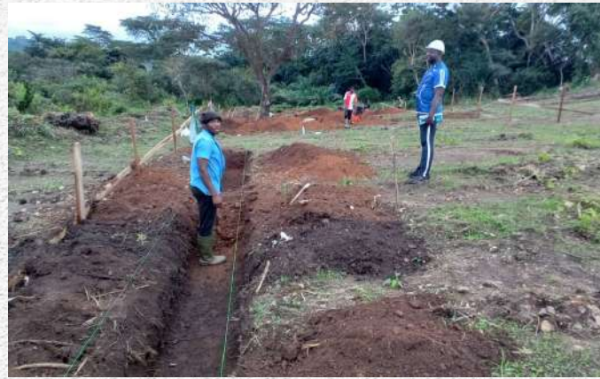
The construction started in late 2023