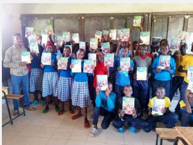
The children with newly received learning materials