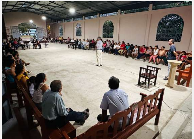
Pastoral visit of Monsignor Alfredo Vizcarra - Bishop of the Apostolic Vicariate