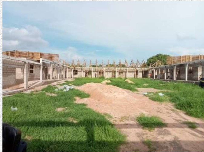
The construction is underway