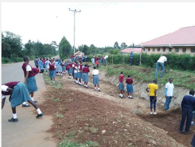
The children engaged in public cleaning