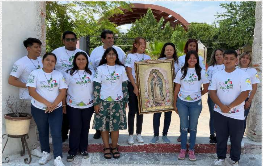
The youth group of the parish