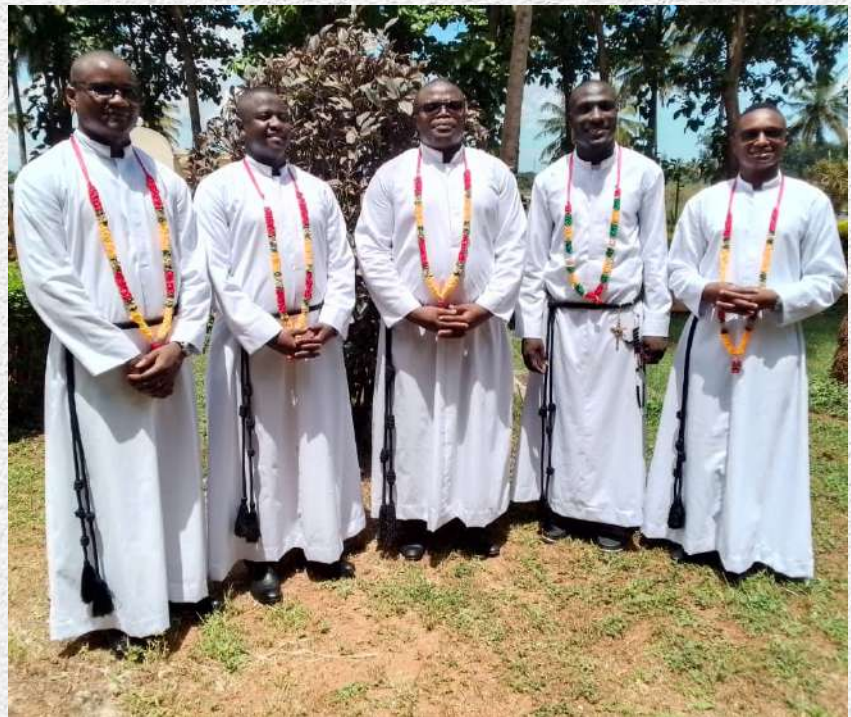
5 confreres professed final vows on 1 January, 2024