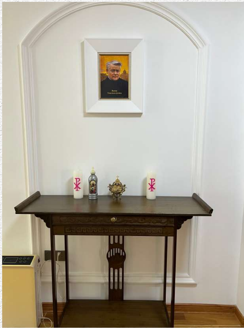
A place dedicated to Bl. Francis Jordan, the founder of Salvatorian as per Chinese tradition at the newly blessed Salvatorian Community house . It is a tradition in China that the ancestors are respected, and their images are placed in household with reverence and respect.