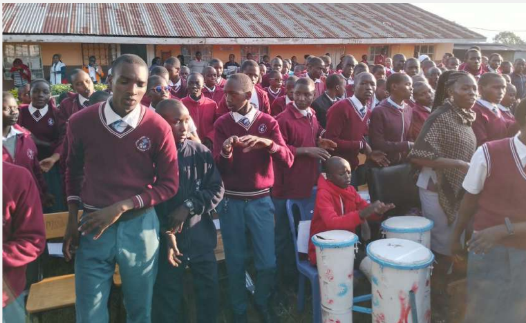
The children dancing during the school day celebrations

The total number of learners in both primary and secondary school is 440 in 2023. While the primary school has a total enrolment of 328 pupils, the secondary school is gradually growing. The Salvatorian school wants to offer the poor children an equal opportunity to excel in life by offering good and quality education which is affordable