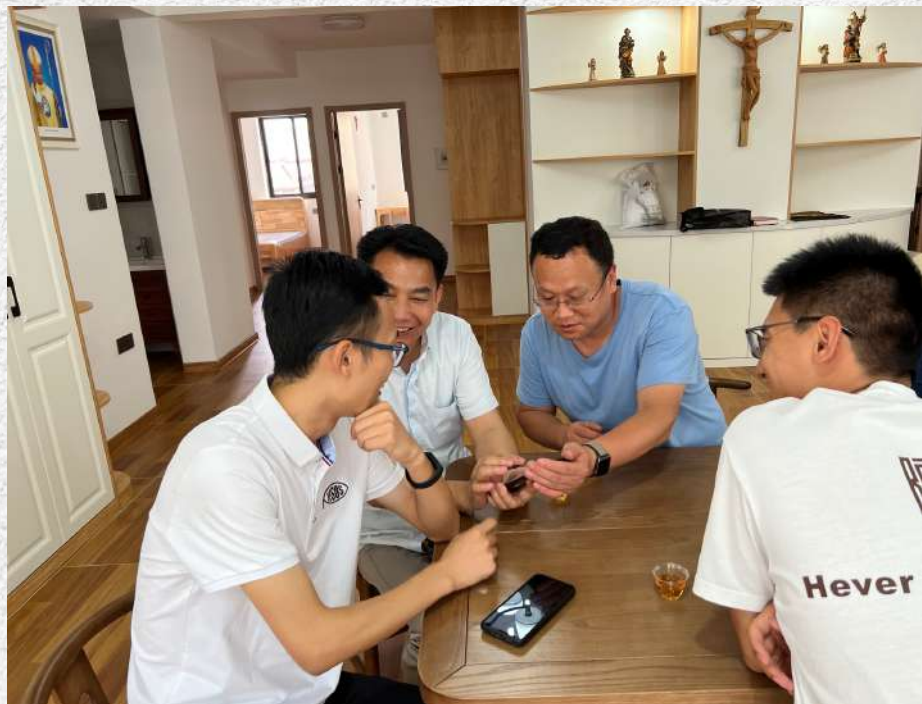
The Salvatorian seminarians from China with two other Salvatorian priests