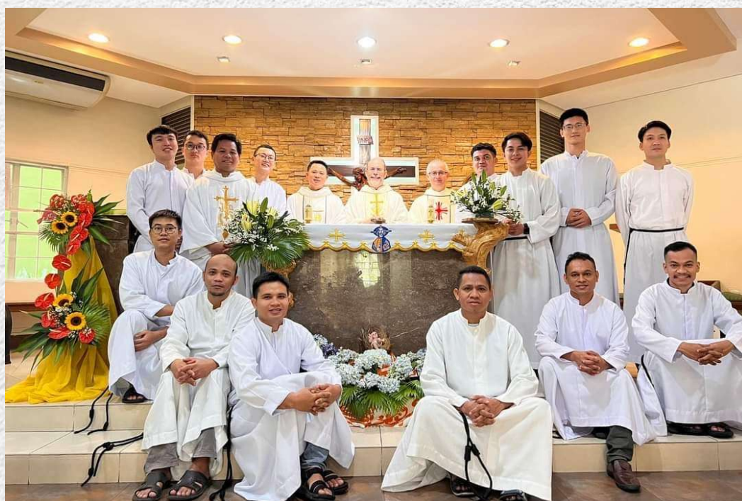
The scholastics of international study house in Manila