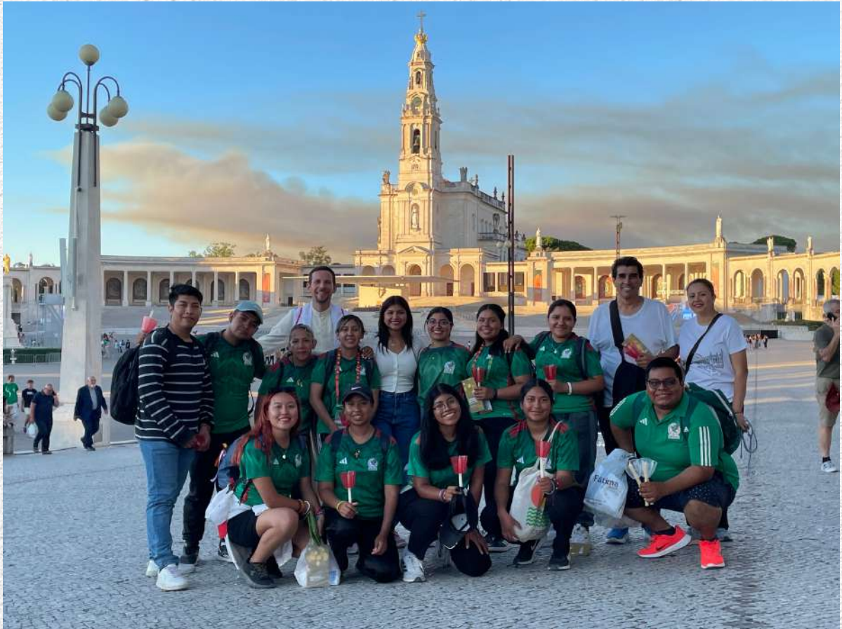
The Salvatorian parish in Xoxocotla was represented in the world youth day in 2023