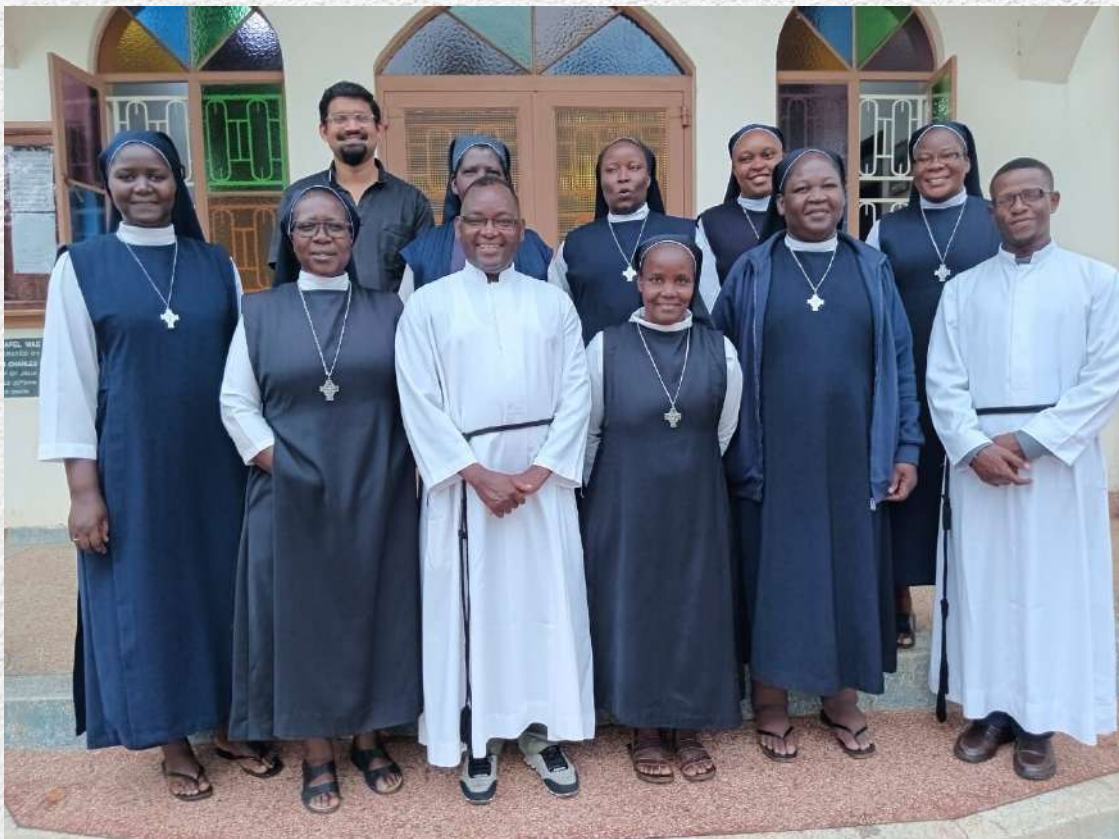
Salvatorians with the Missionary Benedictine sisters in Jinja