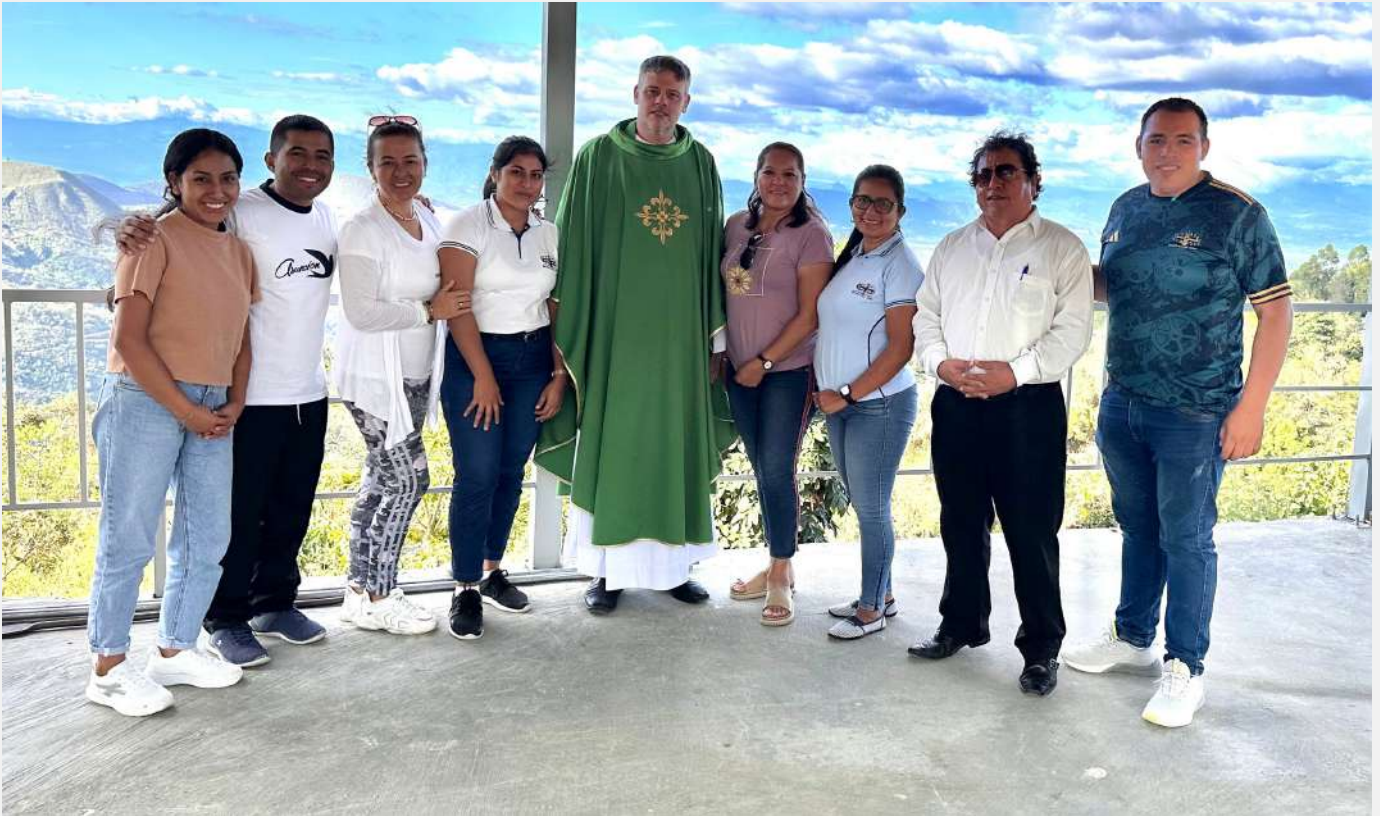
Retreat and training of teachers from the Catholic schools of the Apostolic Vicariate