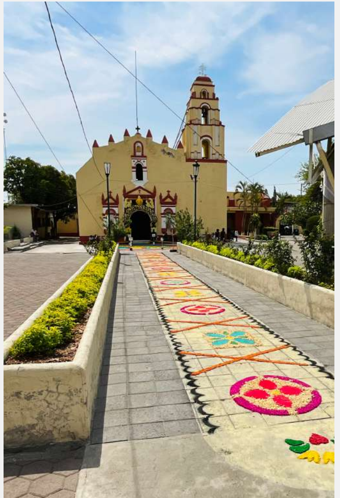
The parish church is adorned with flower decoration on its feast day