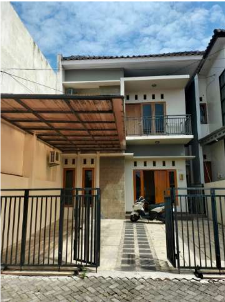
The rented house