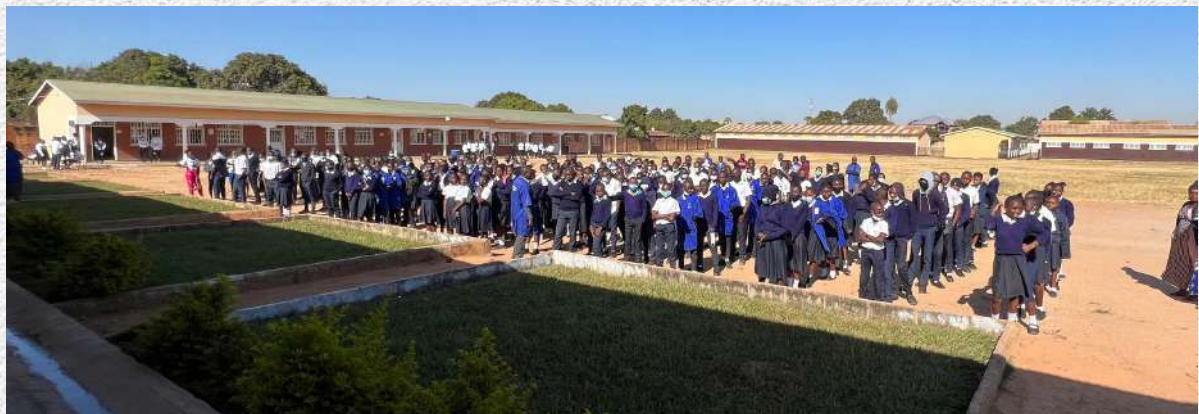
The WOKOVU school