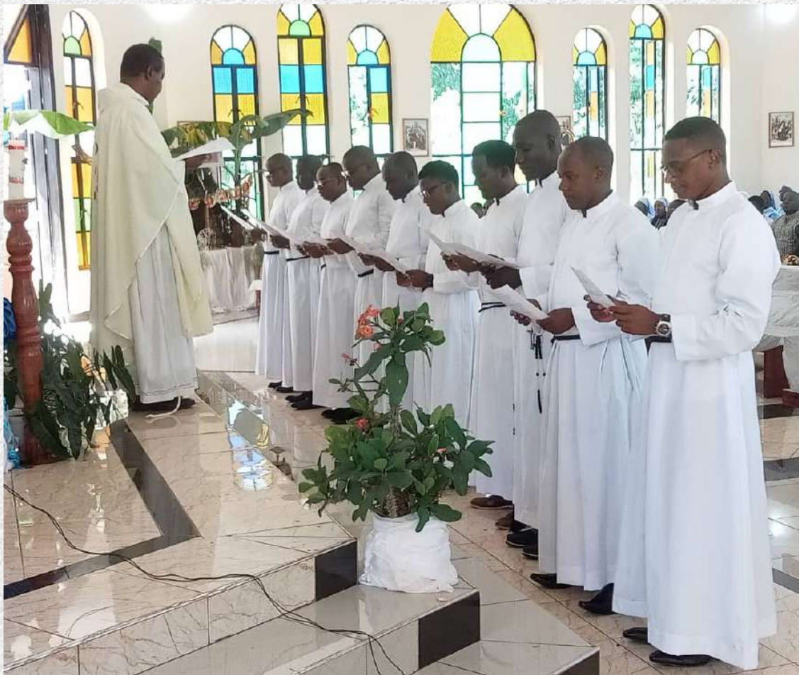
Ten confreres perpetually professed at Mater Salvatoris Scholasticate, Morogoro on 01.January.2024 : five of them from the Tanzanian Mission Pro-province and the other five from the Missionary Pro-province of Congo.