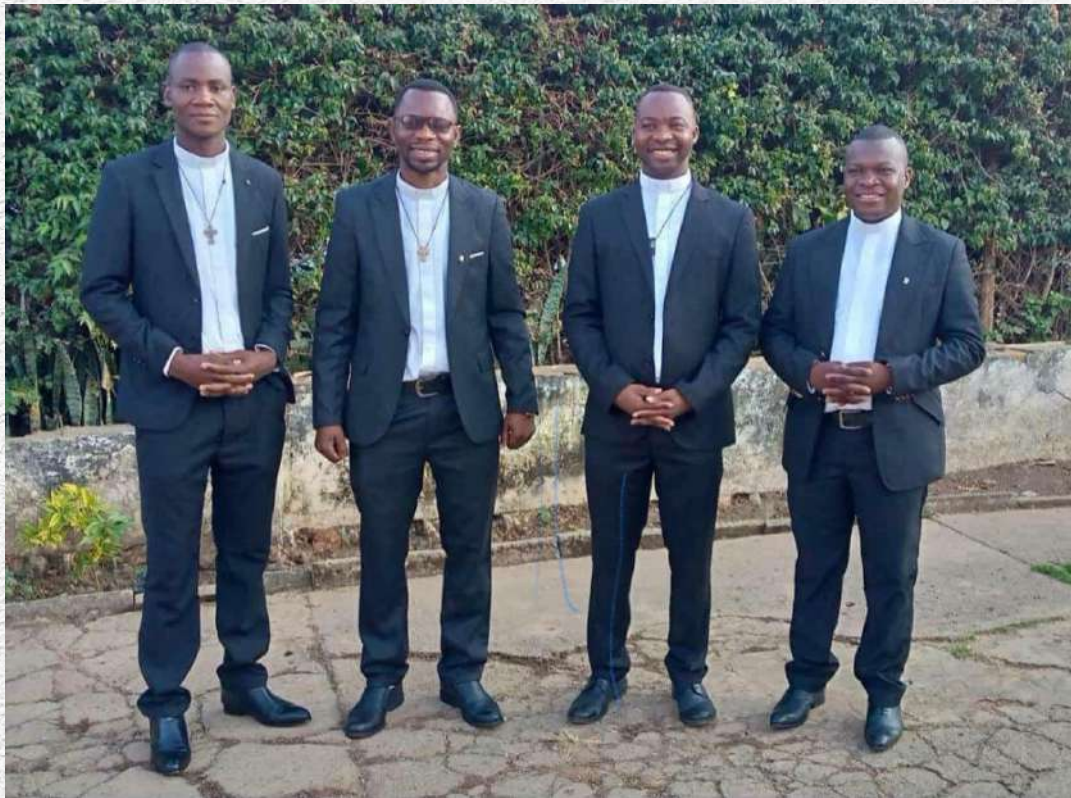
5 Confreres from Congo were ordained to the priesthood on 15 July 2023 in Lubumbashi